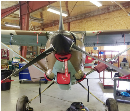
Siai Marchetti 1019 Engine Plugs, Prop Tie-Exhaust Covers