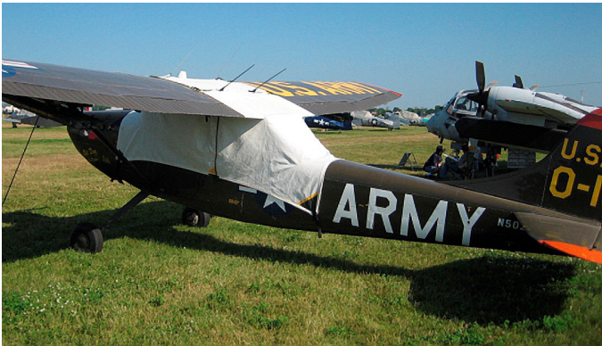
L-19 Canopy Cover (similar to Siai Marchetti 1019)