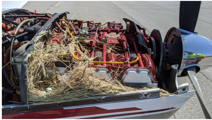
Siai Marchetti 1019 Ventilation Scoop Plugs ENGINE PLUGS PREVENT BIRD NEST FOD. Piper Saratoga Engine Cowling Bird's Nest