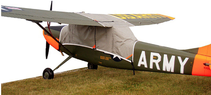
L-19 Canopy Cover (similar to Siai Marchetti 1019)

This cover type is made from Silver Acrylic Sunbrella canvas and is 100% lined with a soft and smooth microfiber. Bruce's Custom Covers developed this material combination especially for aircraft protection. The outer material is medium weight and treated for water resistance, UV resistance and anti-static buildup. The inner lining is a very soft and smooth microfiber to prevent scratching. The material is very reflective, and tests show that the cabin interior temperature can be reduced to near-ambient temperature on the hottest of days. It is water, ice and snow repellent, yet breathable to allow moisture to escape from between the cover and the aircraft surface.