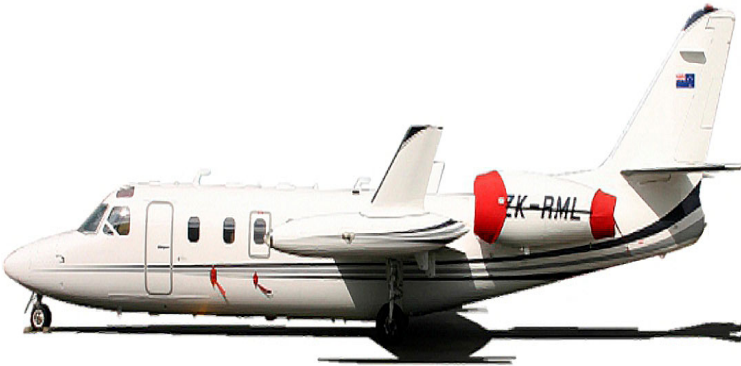
Jet Commander Engine Covers