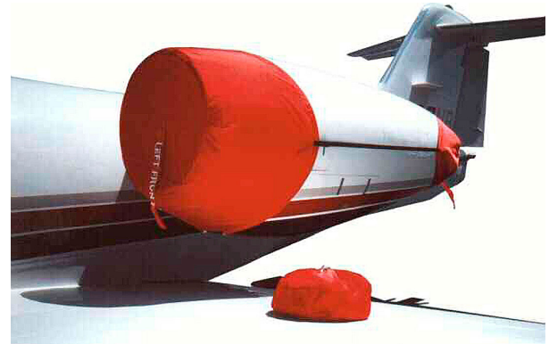
Lear 30 Tri-Fold Engine Cover