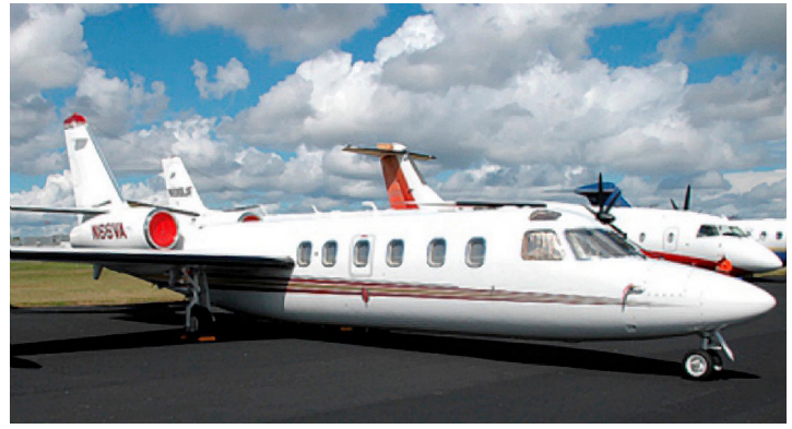
Westwind Engine Intake Plugs