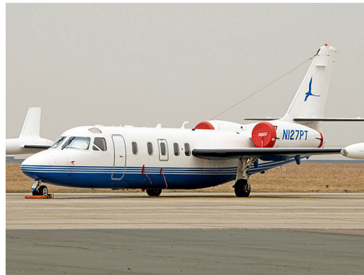
Engine Covers & Cockpit HeatShields

Cockpit Heatshields are interior sunshades for the aircraft's cockpit. The product is a unique composite of closed-cell foam with a silver mylar finish. The semi-rigid design is stiff enough to stand inside the window framing. The set folds up flat and is easily stored in the included storage sleeve. Some designs may require velcro and suction cups. Our Heatshields for jets are offered white side out because some aircraft manufacturers have issued advisories against reflective window inserts due to potential heat damage. A Heatshield is an excellent short-term remedy for cockpit overheating, but an external fabric cover is more effective for long-term protection.