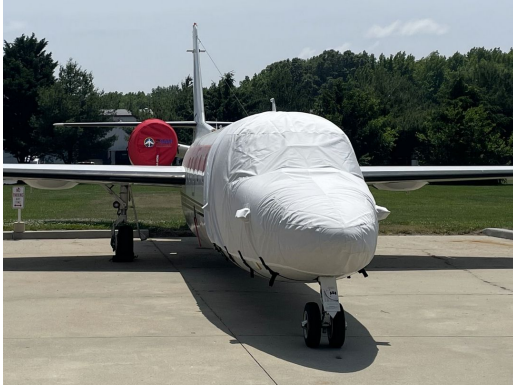
IAI 1124 Cockpit/Nose Cover Extended Aft Over Entry Door

This cover type is made from Silver Acrylic Sunbrella canvas and is 100% lined with a soft and smooth microfiber. Bruce's Custom Covers developed this material combination especially for aircraft protection. The outer material is medium weight and treated for water resistance, UV resistance and anti-static buildup. The inner lining is a very soft and smooth microfiber to prevent scratching. The material is very reflective, and tests show that the cabin interior temperature can be reduced to near-ambient temperature on the hottest of days. It is water, ice and snow repellent, yet breathable to allow moisture to escape from between the cover and the aircraft surface.