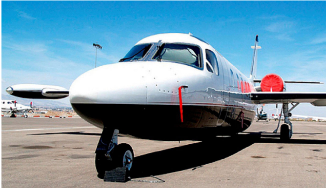
Westwind Engine Cover Set, Pitot Cover

instructions. The aircraft's registration number can be silkscreened onto the cover for an extra charge.