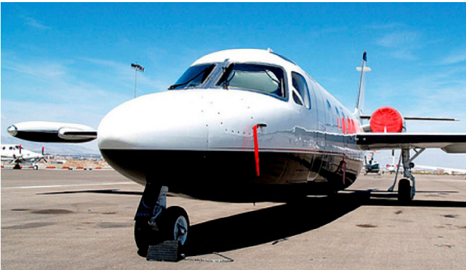
Westwind Engine Cover Set, Pitot Cover