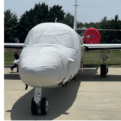
IAI 1124 Cockpit/Nose Cover Extended Aft Over Entry Door