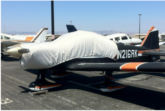
Robin Canopy/Engine Cover

the hottest of days. It is water, ice and snow repellent, yet breathable to allow moisture to escape from between the cover and the aircraft surface.