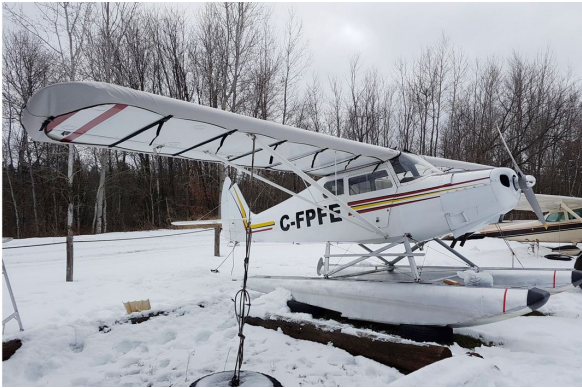
Christavia Mk 1 Wing Covers

WINTER USE MATERIAL - Made with Solution-Dyed Polyester fabric, this option is intended for seasonal use to aid in deicing, rain mitigation, or for occasional travel. The material is lighter and more compact, but more susceptible to UV damage and may have a shorter useful life if used continuously outside than the all-year use material.