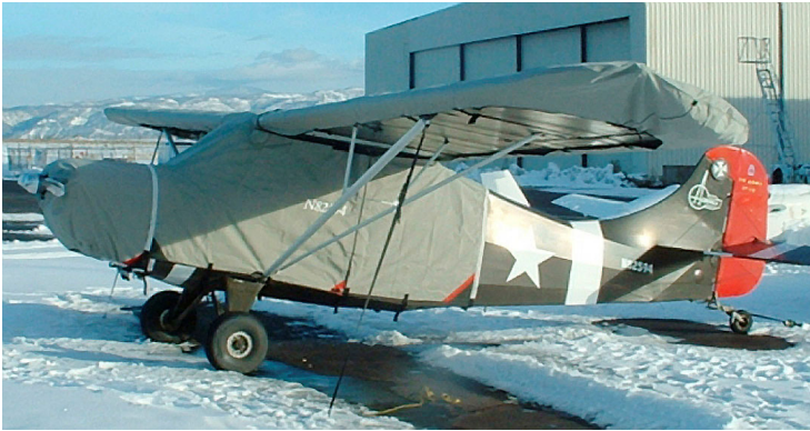
Extended Canopy Cover, Engine & Wing Covers