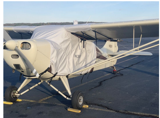
Cub Crafters Carbon Cub FX3 Windshield/Skylight Cover, travel weight Aeronca Chief 11BC Extended Over-Top Canopy Cover