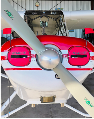
Aeronca 7AC Engine Inlet Plugs

Engine Inlet Plugs are custom fit for your Aeronca Chief 11AC, Super Chief 11CC intakes, made with heavy-duty vinyl material, and stuffed with a single block of sculpted urethane foam. Each plug has a zipper that allows the foam to be removed and dried if necessary. Engine plugs have warning flags that are visible from the cockpit or 'remove before flight' streamers sewn onto the face of the plugs. Most plugs are imprinted with the aircraft registration number in black for an extra charge. Storage bag NOT included. Engine plugs may be inserted after flight when the engine is still warm. Engine Inlet Plugs are commonly referred to as Cowl Plugs, Intake Plugs, Cowl Blocks, Engine Blocks, and Engine Bungs.