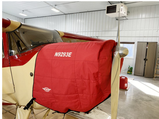
Aeronca 11AC Chief Insulated Engine Cover

This cover type is made from Silver Acrylic Sunbrella canvas and is 100% lined with a soft and smooth microfiber. Bruce's Custom Covers developed this material combination especially for aircraft protection. The outer material is medium weight and treated for water resistance, UV resistance and anti-static buildup. The inner lining is a very soft and smooth microfiber to prevent scratching. The material is very reflective, and tests show that the cabin interior temperature can be reduced to near-ambient temperature on the hottest of days. It is water, ice and snow repellent, yet breathable to allow moisture to escape from between the cover and the aircraft surface.