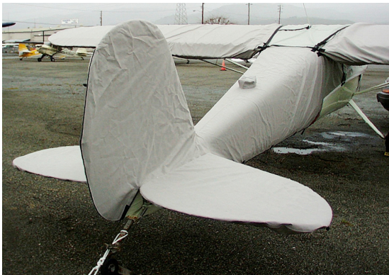
Cessna 120 Empennage Cover

WINTER USE MATERIAL - Made with Solution-Dyed Polyester fabric, this option is intended for seasonal use to aid in deicing, rain mitigation, or for occasional travel. The material is lighter and more compact, but more susceptible to UV damage and may have a shorter useful life if used continuously outside than the all-year use material.