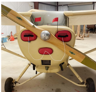
Aeronca 11AC Chief Engine Plugs

Engine Inlet Plugs are custom fit for your Aeronca Chief 11AC, Super Chief 11CC intakes, made with heavy-duty vinyl material, and stuffed with a single block of sculpted urethane foam. Each plug has a zipper that allows the foam to be removed and dried if necessary. Engine plugs have warning flags that are visible from the cockpit or 'remove before flight' streamers sewn onto the face of the plugs. Most plugs are imprinted with the aircraft registration number in black for an extra charge. Storage bag NOT included. Engine plugs may be inserted after flight when the engine is still warm. Engine Inlet Plugs are commonly referred to as Cowl Plugs, Intake Plugs, Cowl Blocks, Engine Blocks, and Engine Bungs.