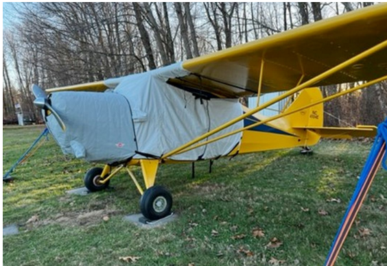
Aeronca Super Chief 11CC Extended Over-Top Canopy Cover, Insulated Engine Cover

This cover type is made from Silver Acrylic Sunbrella canvas and is 100% lined with a soft and smooth microfiber. Bruce's Custom Covers developed this material combination especially for aircraft protection. The outer material is medium weight and treated for water resistance, UV resistance and anti-static buildup. The inner lining is a very soft and smooth microfiber to prevent scratching. The material is very reflective, and tests show that the cabin interior temperature can be reduced to near-ambient temperature on the hottest of days. It is water, ice and snow repellent, yet breathable to allow moisture to escape from between the cover and the aircraft surface.