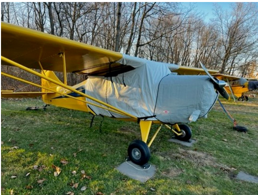
Aeronca Super Chief 11CC Extended Over-Top Canopy Cover, Insulated Engine Cover