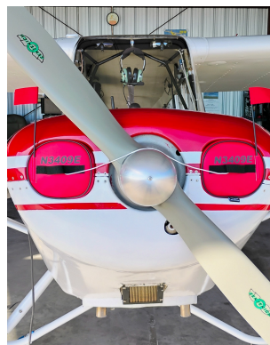
Aeronca 7AC Engine Inlet Plugs