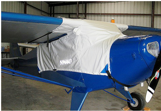
Aeronca Super Chief 11CC Extended Over-Top Canopy Cover, Insulated Engine Taylorcraft BC12-D Over-the-top Canopy Cover