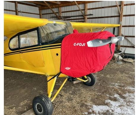
Aeronca 11AC Chief Insulated Engine Cover