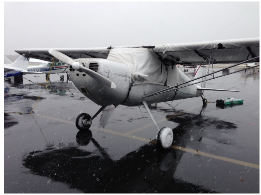
Cessna 120/140 Canopy and Wing Covers