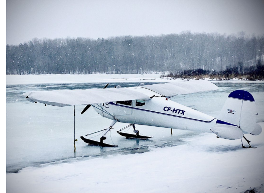
Cessna 140 Wing & Tail Covers