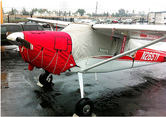
Cessna 180 Insulated Engine Cover

This cover type is made from Silver Acrylic Sunbrella canvas and is 100% lined with a soft and smooth microfiber. Bruce's Custom Covers developed this material combination especially for aircraft protection. The outer material is medium weight and treated for water resistance, UV resistance and anti-static buildup. The inner lining is a very soft and smooth microfiber to prevent scratching. The material is very reflective, and tests show that the cabin interior temperature can be reduced to near-ambient temperature on the hottest of days. It is water, ice and snow repellent, yet breathable to allow moisture to escape from between the cover and the aircraft surface.