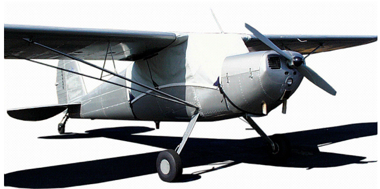
Cessna 120 Over-Top Canopy Cover