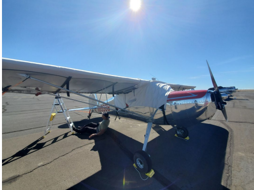
Cessna 140 Over The Top Style Canopy Cover

WINTER USE MATERIAL - Made with Solution-Dyed Polyester fabric, this option is intended for seasonal use to aid in deicing, rain mitigation, or for occasional travel. The material is lighter and more compact, but more susceptible to UV damage and may have a shorter useful life if used continuously outside than the all-year use material.