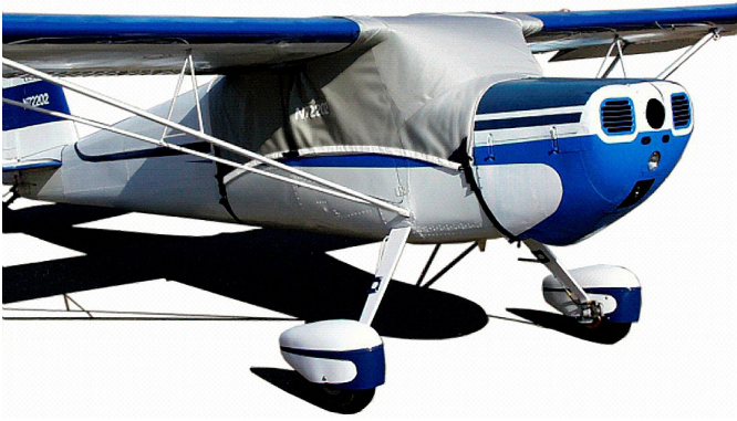
Cessna 120 Over-Top Canopy Cover