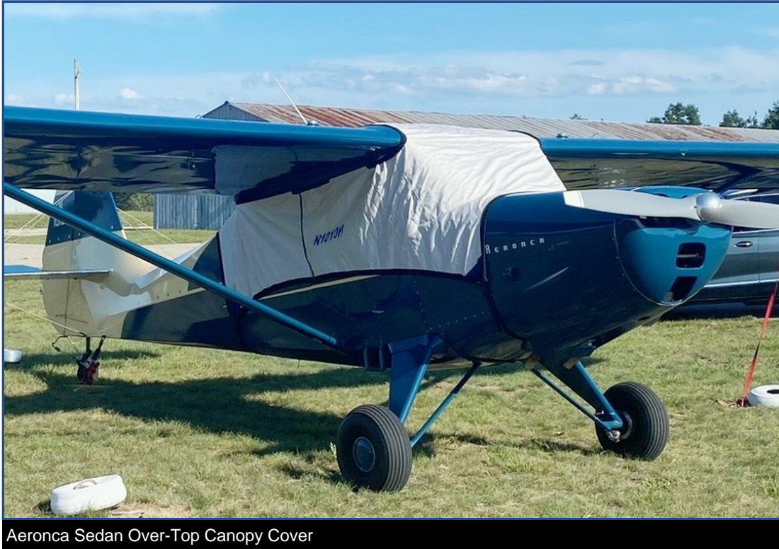
Aeronca Sedan Over-Top Canopy Cover