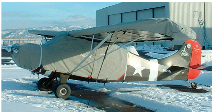
Extended Canopy Cover, Engine & Wing Covers

WINTER USE MATERIAL - Made with Solution-Dyed Polyester fabric, this option is intended for seasonal use to aid in deicing, rain mitigation, or for occasional travel. The material is lighter and more compact, but more susceptible to UV damage and may have a shorter useful life if used continuously outside than the all-year use material.