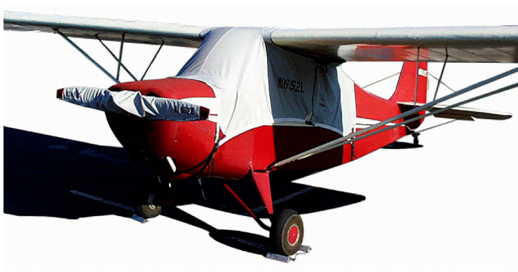
Aeronca Champ Canopy & Prop Covers