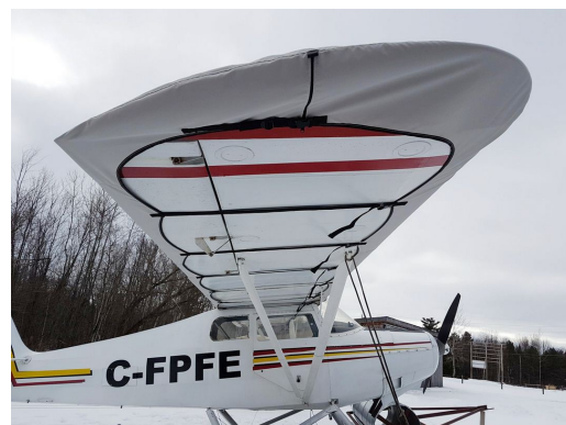
Christavia Mk 1 Wing Covers