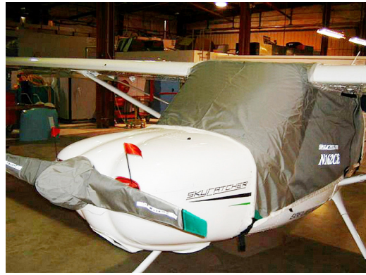
Cessna Skycatcher Spandex FlyAway Travel Cover Cessna Skycatcher Standard Canopy Cover, Propellor Cover & Engine Inlet Plugs