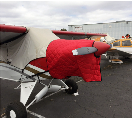
Insulated Hangar Blanket on Cessna 182 FOR INTERIOR USE. Cub Crafters CC-11 Insulated Hangar Blanket, available in Red or Silver