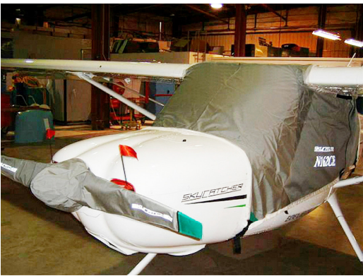
Cessna Skycatcher Prop/Spinner Cover, Engine Plugs Cessna Skycatcher Standard Canopy Cover, Propellor Cover & Engine Inlet Plugs