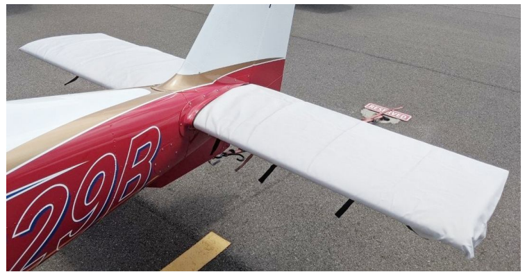
Cessna 162 Skycatcher Horizontal Stabilizer Covers