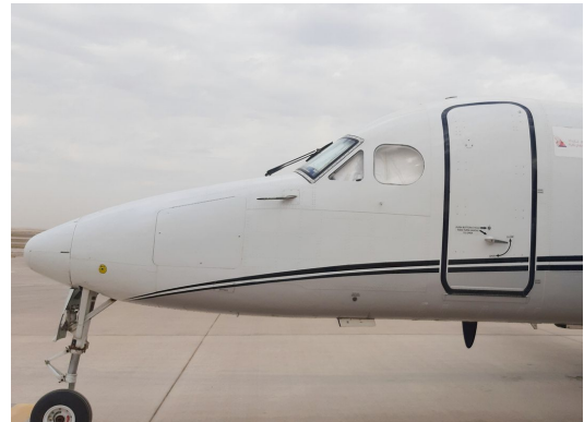
Raytheon 1900D Cockpit HeatShields