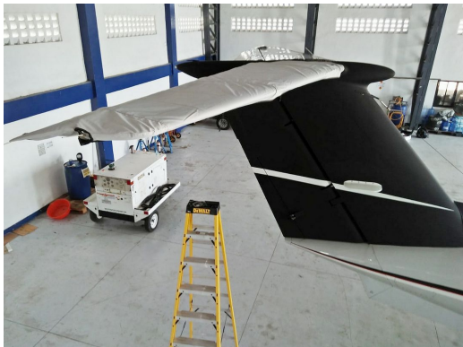
Beech King Air B350 Horizontal Stabilizer Covers

WINTER USE MATERIAL - Made with Solution-Dyed Polyester fabric, this option is intended for seasonal use to aid in deicing, rain mitigation, or for occasional travel. The material is lighter and more compact, but more susceptible to UV damage and may have a shorter useful life if used continuously outside than the all-year use material.