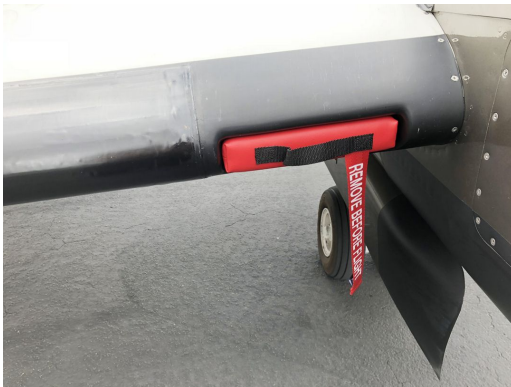
Beech King Air Heat Exchanger Inlet Plug

Engine Inlet Plugs are custom fit for your Beech 1900D intakes, made with heavy-duty vinyl material, and stuffed with a single block of sculpted urethane foam. Each plug has a zipper that allows the foam to be removed and dried if necessary. Engine plugs have warning flags that are visible from the cockpit or 'remove before flight' streamers sewn onto the face of the plugs. Most plugs are imprinted with the aircraft registration number in black for an extra charge. Storage bag NOT included. Engine plugs may be inserted after flight when the engine is still warm. Engine Inlet Plugs are commonly referred to as Cowl Plugs, Intake Plugs, Cowl Blocks, Engine Blocks, and Engine Bungs.