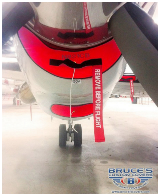
Engine and Oil Cooler Inlet Plugs

Engine Inlet Plugs are custom fit for your Beech 1900D intakes, made with heavy-duty vinyl material, and stuffed with a single block of sculpted urethane foam. Each plug has a zipper that allows the foam to be removed and dried if necessary. Engine plugs have warning flags that are visible from the cockpit or 'remove before flight' streamers sewn onto the face of the plugs. Most plugs are imprinted with the aircraft registration number in black for an extra charge. Storage bag NOT included. Engine plugs may be inserted after flight when the engine is still warm. Engine Inlet Plugs are commonly referred to as Cowl Plugs, Intake Plugs, Cowl Blocks, Engine Blocks, and Engine Bunges.