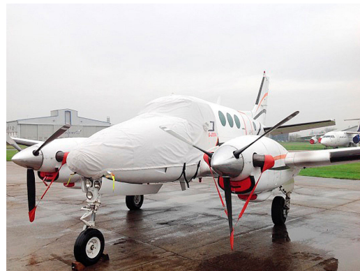
King Air Cockpit/Nose Cover, Plugs, Prop Tie/Exhaust Covers