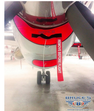
Engine and Oil Cooler Inlet Plugs