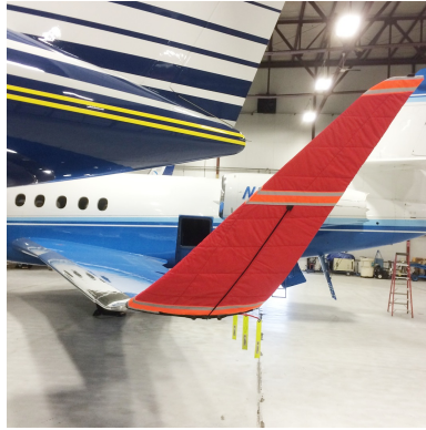
Falcon 2000 Winglet Pad

shorter useful life if used continuously outside than the all-year use material.