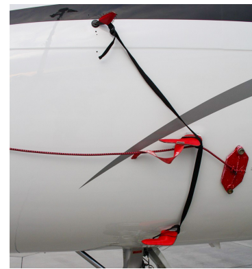
Falcon Jet 2000 Pitot Covers, Aoa's, Tat Cover Set, Heat Resistant Type