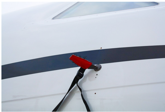
Falcon Jet 2000 Pitot Covers, Aoa's, Tat Cover Set, Heat Resistant Type