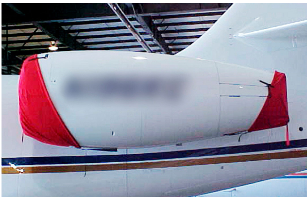
Falcon 2000 Intake/Exhaust Cover Set

The Falcon Jet 2000 Intake Covers are designed to install easily yet be completely storable. A spring steel hoop is sewn into the hem of each cover, allowing them to be installed without climbing onto the wing or using a stepladder. To store the covers the spring steel hoop folds like a band-saw blade into three nesting rings. Each cover folds into a compact circular bundle which is stored in the included duffle bag, yet they unfold quickly for use. The Tri-Fold Ring cover is made of medium weight nylon which is available in a variety of colors to match the paint trim. Each cover set comes complete with installation and folding instructions. The aircraft's registration number can be silkscreened onto the cover for an extra charge.