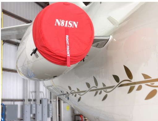
Falcon 900EX Intake Cover

The Falcon Jet 2000 Intake Covers are designed to install easily yet be completely storable. A spring steel hoop is sewn into the hem of each cover, allowing them to be installed without climbing onto the wing or using a stepladder. To store the covers the spring steel hoop folds like a band-saw blade into three nesting rings. Each cover folds into a compact circular bundle which is stored in the included duffle bag, yet they unfold quickly for use. The Tri-Fold Ring cover is made of medium weight nylon which is available in a variety of colors to match the paint trim. Each cover set comes complete with installation and folding instructions. The aircraft's registration number can be silkscreened onto the cover for an extra charge.