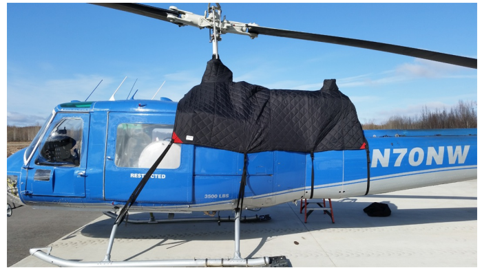
Bell 204 Insulated Engine Area Cover