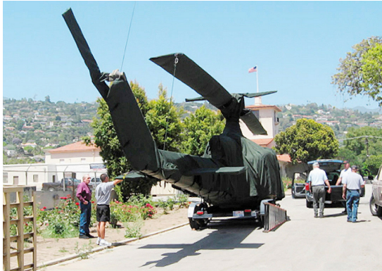
Bell 204/205 Full Body Cover Set

This cover type is made from Silver Acrylic Sunbrella canvas and is 100% lined with a soft and smooth microfiber. Bruce's Custom Covers developed this material combination especially for aircraft protection. The outer material is medium weight and treated for water resistance, UV resistance and anti-static buildup. The inner lining is a very soft and smooth microfiber to prevent scratching. The material is very reflective, and tests show that the cabin interior temperature can be reduced to near-ambient temperature on the hottest of days. It is water, ice and snow repellent, yet breathable to allow moisture to escape from between the cover and the aircraft surface.