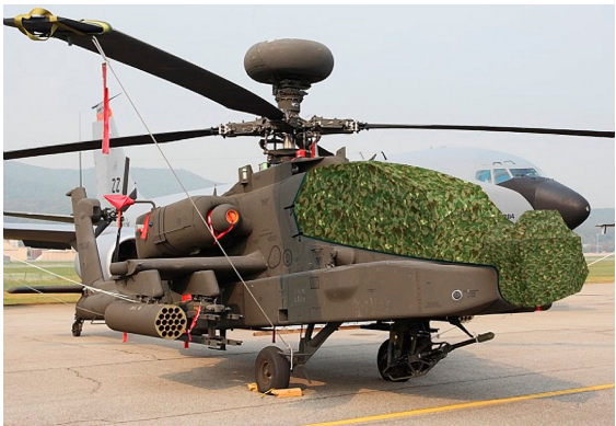
Canopy/Nose Cover, covers canopy glass and TADS