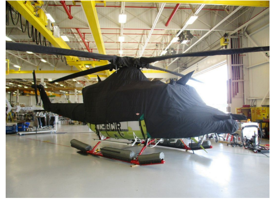
Bell 412 Cockpit/Canopy/Nose, Insulated Engine Area, Rotor Hub, Blade, Tailboom and Tail Rotor Covers