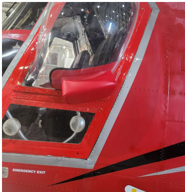
Boeing Vertol CH-47 Logger Window Plug

The Engine Inlet Plugs are custom fit for your Bell 212 intakes, made with heavy-duty vinyl material, and stuffed with a single block of sculpted urethane foam. Each plug has a zipper that allows the foam to be removed and dried if necessary. Engine plugs have 'Remove Before Flight' streamers sewn onto the face of the plugs. Most plugs are imprinted with the aircraft registration number in black for an extra charge. Storage bag NOT included. Engine plugs may be inserted after flight when the engine is still warm. Engine Inlet Plugs are commonly referred to as Cowl Plugs, Intake Plugs, Cowl Blocks, Engine Blocks, and Engine Bungs.