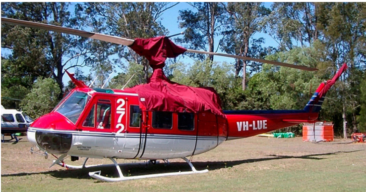
Bell 204/205 Engine/Mid-Cabin Cover, Main & Tail Rotor Covers

WINTER USE MATERIAL - Made with Solution-Dyed Polyester fabric, this option is intended for seasonal use to aid in deicing, rain mitigation, or for occasional travel. The material is lighter and more compact, but more susceptible to UV damage and may have a shorter useful life if used continuously outside than the all-year use material.