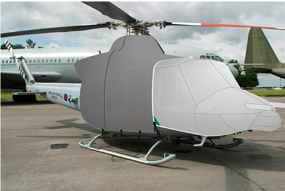
Bell 412 Forward Cabin/Nose, Insulated Engine, Tailboom, Rotor Hub Forward Cabin Nose & Mid-Cabin/Engine Cover (extended to cross tubes) & Blade Covers