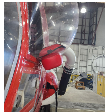
Boeing Vertol CH-47 Logger Window Plug