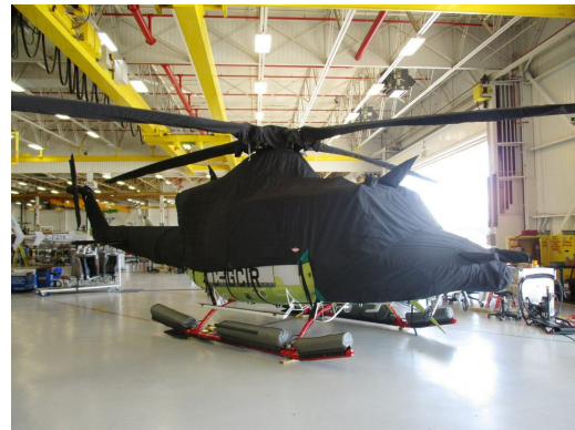
Bell 412 Cockpit/Canopy/Nose, Insulated Engine Area, Rotor Hub, Blade, Tailboom and Tail Rotor Covers