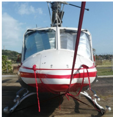
Bell 212 Windshield HeatShields

Cockpit Heatshields are interior sunshades for the aircraft's cockpit. The product is a unique composite of closed-cell foam with a silver mylar finish. The semi-rigid design is stiff enough to stand inside the window framing. Darts and folds are incorporated into the material so that it conforms to the complex shape of the helicopter windows. The set folds up flat and is easily stored in the included storage sleeve. Some designs may require velcro and suction cups. A Heatshield is an excellent short-term remedy for cockpit overheating, but an external fabric cover is more effective for long-term protection.