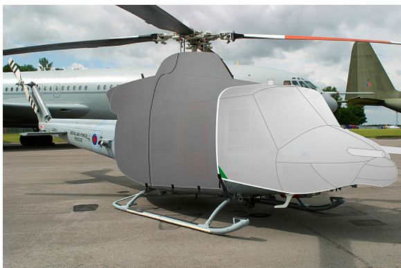
Forward Cabin Nose & Mid-Cabin/Engine Cover (extended to cross tubes)

This cover type is made from Silver Acrylic Sunbrella canvas and is 100% lined with a soft and smooth microfiber. Bruce's Custom Covers developed this material combination especially for aircraft protection. The outer material is medium weight and treated for water resistance, UV resistance and anti-static buildup. The inner lining is a very soft and smooth microfiber to prevent scratching. The material is very reflective, and tests show that the cabin interior temperature can be reduced to near-ambient temperature on the hottest of days. It is water, ice and snow repellent, yet breathable to allow moisture to escape from between the cover and the aircraft surface.