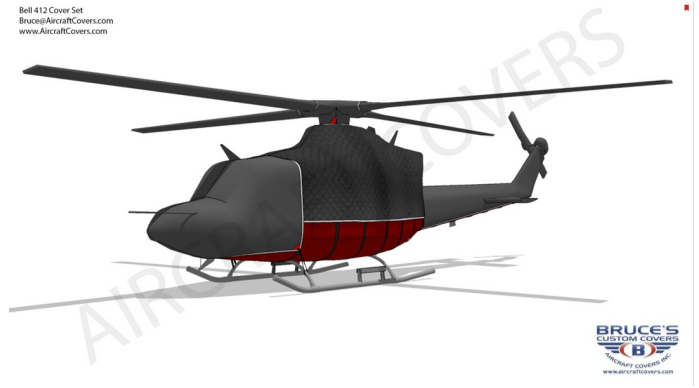
Bell 412 Forward Cabin/Nose, Insulated Engine, Tailboom, Rotor Hub & Blade Covers