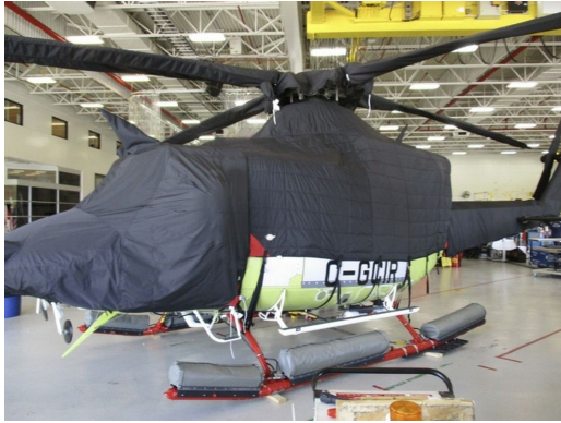
Bell 412 Cockpit/Canopy/Nose, Insulated Engine Area, Rotor Hub, Blade, Tailboom and Tail Rotor Covers

available separately. Specific information for each model is available on request.