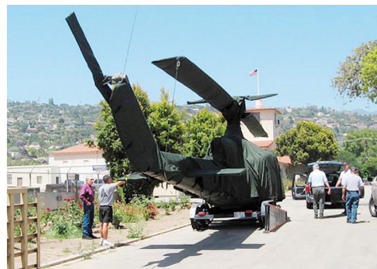
Bell 204/205 Full Body Cover Set