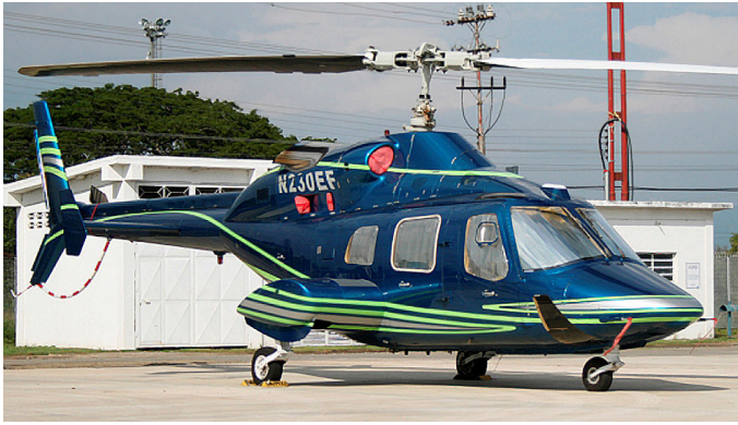
Bell 230 Engine Plugs, HeatShields

Heatshields are interior sunshades for an aircraft's windows or canopy glass. The product is a unique composite of closed-cell foam with a silver mylar finish. The semi-rigid design is stiff enough to stand along the inside of the windshield using sun visors or window framing. It folds up flat and easily stores in the included storage sleeve. Some designs may require velcro and suction cups. A Heatshield is an excellent short-term remedy for cockpit overheating.