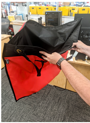
Semi-rigid for easy installation.