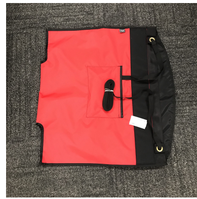
Full size blade cover.