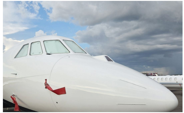
Dassault Aviation FALCON 2000EX Cockpit Heatshields (set of 7) Dassault Aviation FALCON 2000EX Cockpit Heatshields (set of 7)