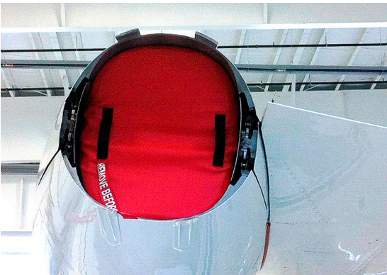
Falcon 2000EX Exhaust Plug