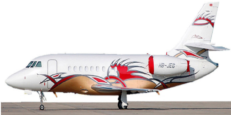
Falcon 2000EX Engine Cover Set, OEM Design