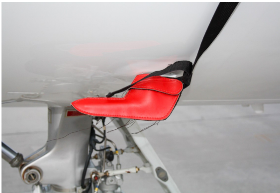
Falcon Jet 2000EX, 2000LXS Pitot Covers, Aoa's, Tat Cover Set, Heat Resistant Type

The Engine Inlet Plugs are custom fit for your Falcon Jet 2000EX, 2000LXS intakes, made with heavy-duty vinyl material, and stuffed with a single block of sculpted urethane foam. Each plug has a zipper that allows the foam to be removed and dried if necessary. Engine plugs have 'remove before flight' streamers sewn onto the face of the plugs. Most plugs are imprinted with the aircraft registration number in black for an extra charge. Storage bag NOT included. Engine plugs may be inserted after flight when the engine is still warm. Engine Inlet Plugs are commonly referred to as Cowl Plugs, Intake Plugs, Cowl Blocks, Engine Blocks, and Engine Bungs.