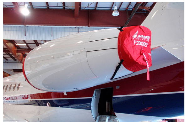
Intake Covers, OEM type (p/n 2KEX-101)