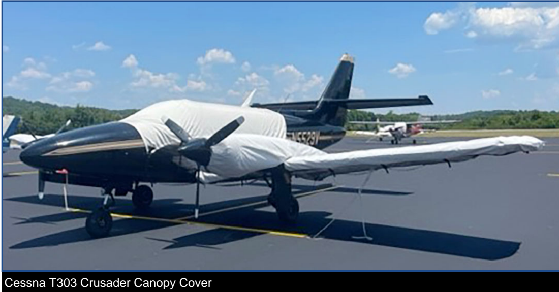
Cessna T303 Crusader Canopy Cover