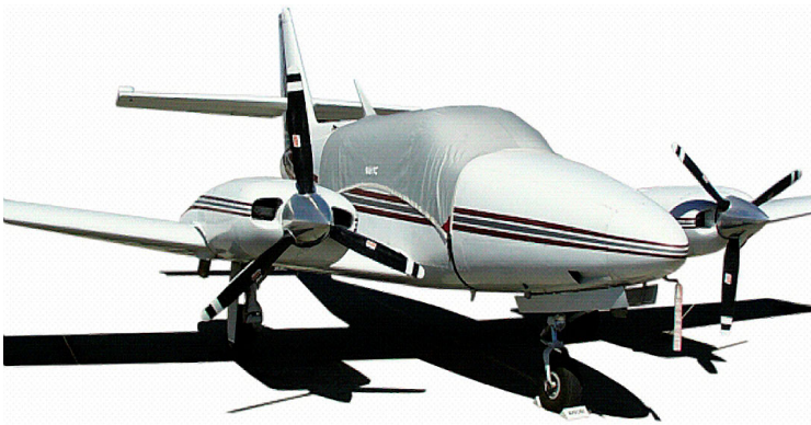
Cessna Crusader Standard Canopy Cover

This cover type is made from Silver Acrylic Sunbrella canvas and is 100% lined with a soft and smooth microfiber. Bruce's Custom Covers developed this material combination especially for aircraft protection. The outer material is medium weight and treated for water resistance, UV resistance and anti-static buildup. The inner lining is a very soft and smooth microfiber to prevent scratching. The material is very reflective, and tests show that the cabin interior temperature can be reduced to near-ambient temperature on the hottest of days. It is water, ice and snow repellent, yet breathable to allow moisture to escape from between the cover and the aircraft surface.