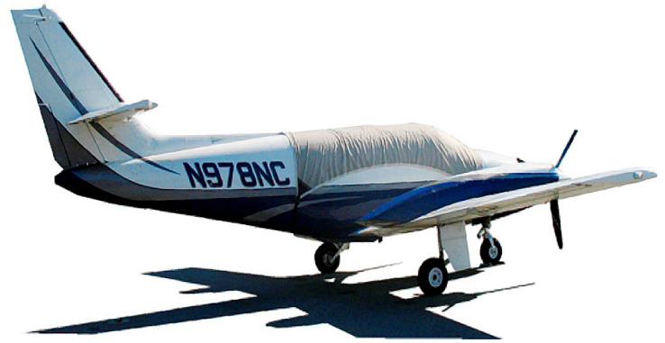
Cessna 303 Crusader Canopy Cover