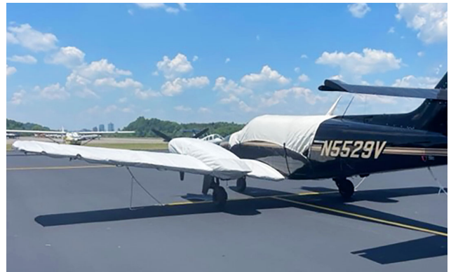
Cessna T303 Crusader Canopy Cover