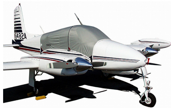
Cessna 310A Canopy Cover