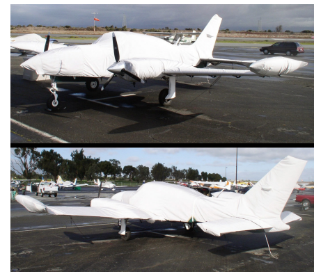
Cessna 310 Complete Cover Set