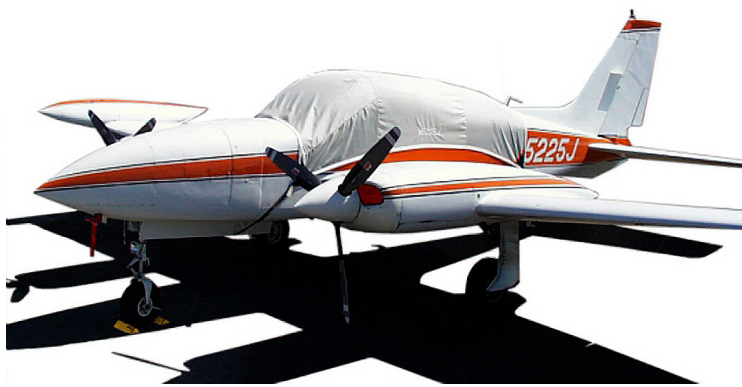
Cessna 310Q Canopy Cover