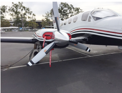
Cessna 414 Engine Inlet Plugs

Engine Inlet Plugs are custom fit for your Cessna 320 intakes, made with heavy-duty vinyl material, and stuffed with a single block of sculpted urethane foam. Each plug has a zipper that allows the foam to be removed and dried if necessary. Engine plugs have warning flags that are visible from the cockpit or 'remove before flight' streamers sewn onto the face of the plugs. Most plugs are imprinted with the aircraft registration number in black for an extra charge. Storage bag NOT included. Engine plugs may be inserted after flight when the engine is still warm. Engine Inlet Plugs are commonly referred to as Cowl Plugs, Intake Plugs, Cowl Blocks, Engine Blocks, and Engine Bungs.