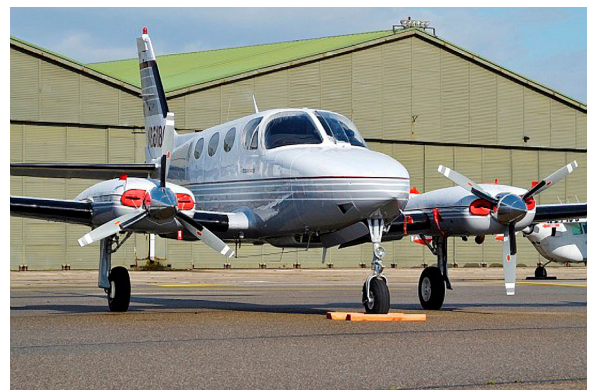
Cessna 340 Engine Plugs