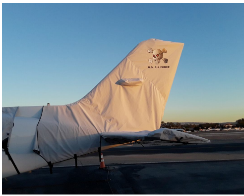
Cessna 421 Empennage Cover