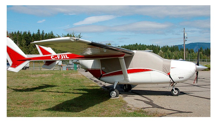
Cessna 337 Skymaster Canopy Cover w/ 14" bib ext.

This cover type is made from Silver Acrylic Sunbrella canvas and is 100% lined with a soft and smooth microfiber. Bruce's Custom Covers developed this material combination especially for aircraft protection. The outer material is medium weight and treated for water resistance, UV resistance and anti-static buildup. The inner lining is a very soft and smooth microfiber to prevent scratching. The material is very reflective, and tests show that the cabin interior temperature can be reduced to near-ambient temperature on the hottest of days. It is water, ice and snow repellent, yet breathable to allow moisture to escape from between the cover and the aircraft surface.