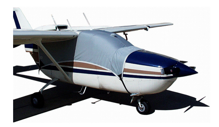
Cessna Skymaster Canopy Cover with Forward Extension, Fwd. Engine Plugs, Aft Engine Cover