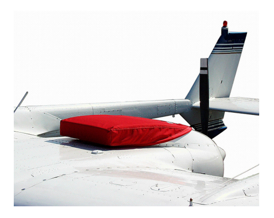
Cessna 337 Skymaster Aft Engine Inlet Cover, Rear Engine Plugs (SOLD SEPARATELY)