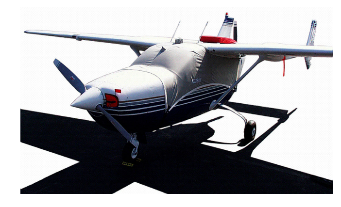
Cessna Skymaster Canopy Cover with Forward Extension, Fwd. Engine Plugs, Aft Engine Cover