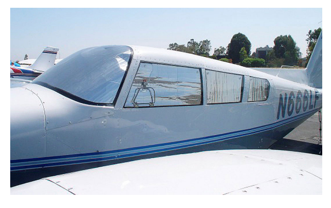
Piper PA-30 Twin Comanche Cockpit HeatShields