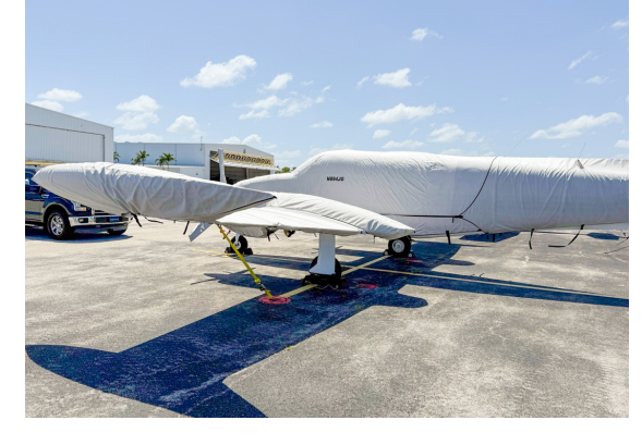
Cessna 340A Engine Inlet Plugs