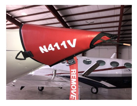
Cessna 335, 340 Wingtip Pads