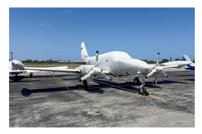
Cessna 340 Complete Cover Set

WINTER USE MATERIAL - Made with Solution-Dyed Polyester fabric, this option is intended for seasonal use to aid in deicing, rain mitigation, or for occasional travel. The material is lighter and more compact, but more susceptible to UV damage and may have a shorter useful life if used continuously outside than the all-year use material.