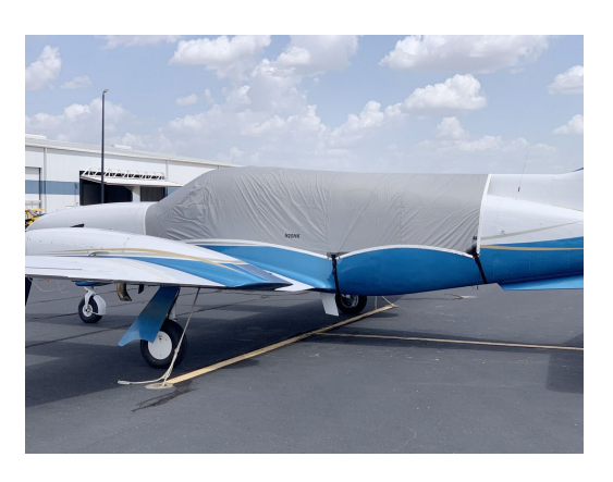
Cessna 414 Travel Weight Canopy Cover