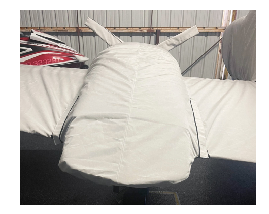
Cessna 335, 340 Empennage Cover (Tailboom, Vertical & Horiz Stabilizers), All Year Use