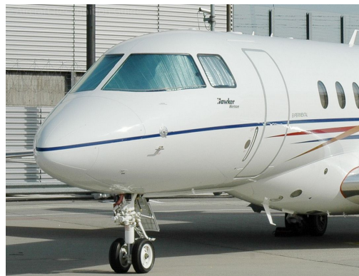
Hawker Beechcraft 4000 Horizon Cockpit Heatshields