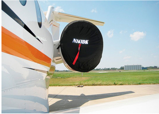
Hawker 4000 Intake Cover

The Hawker Beechcraft 4000 Horizon Intake Covers are designed to install easily yet be completely storable. A spring steel hoop is sewn into the hem of each cover, allowing them to be installed without climbing onto the wing or using a stepladder. To store the covers the spring steel hoop folds like a band-saw blade into three nesting rings. Each cover folds into a compact circular bundle which is stored in the included duffle bag, yet they unfold quickly for use. The Tri-Fold Ring cover is made of medium weight nylon which is available in a variety of colors to match the paint trim. Each cover set comes complete with installation and folding instructions. The aircraft's registration number can be silkscreened onto the cover for an extra charge.