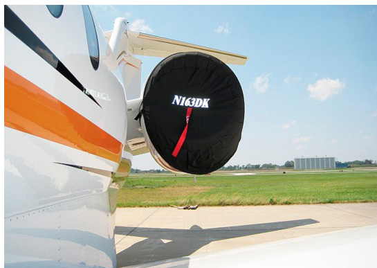
Hawker 4000 Intake Cover

The Hawker Beechcraft 4000 Horizon Intake Covers are designed to install easily yet be completely storable. A spring steel hoop is sewn into the hem of each cover, allowing them to be installed without climbing onto the wing or using a stepladder. To store the covers the spring steel hoop folds like a band-saw blade into three nesting rings. Each cover folds into a compact circular bundle which is stored in the included duffle bag, yet they unfold quickly for use. The Tri-Fold Ring cover is made of medium weight nylon which is available in a variety of colors to match the paint trim. Each cover set comes complete with installation and folding instructions. The aircraft's registration number can be silkscreened onto the cover for an extra charge.