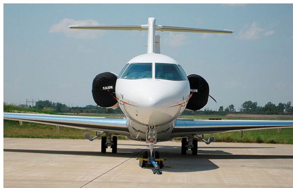
Hawker 4000 Intake Covers