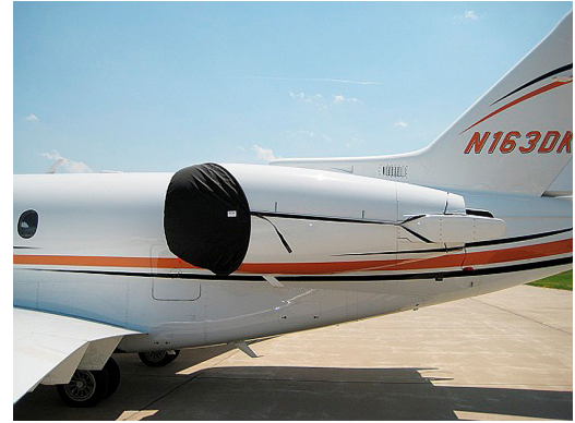
Hawker 4000 Intake Cover