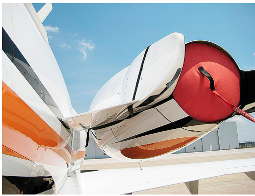
Hawker 4000 Exhaust Plug