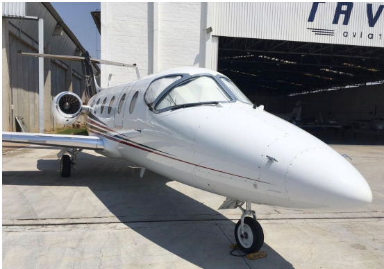
Beechjet Cockpit Heatshields

Cockpit Heatshields are interior sunshades for the aircraft's cockpit. The product is a unique composite of closed-cell foam with a silver mylar finish. The semi-rigid design is stiff enough to stand inside the window framing. The set folds up flat and is easily stored in the included storage sleeve. Some designs may require velcro and suction cups. Our Heatshields for jets are offered white side out because some aircraft manufacturers have issued advisories against reflective window inserts due to potential heat damage. A Heatshield is an excellent short-term remedy for cockpit overheating, but an external fabric cover is more effective for long-term protection.