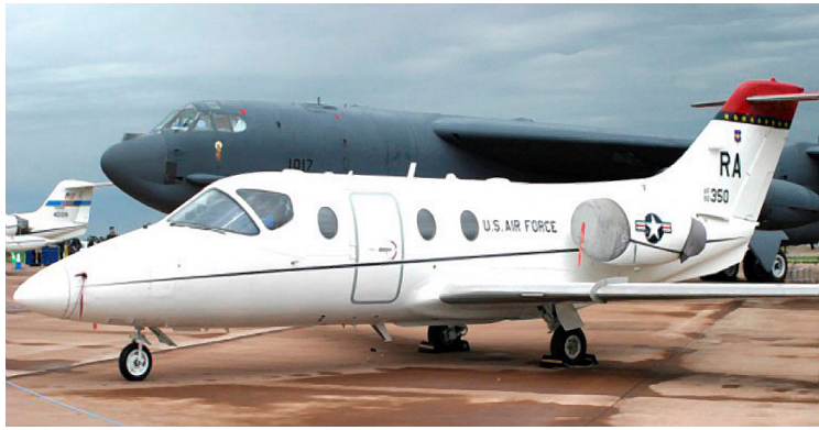
Beechjet 400A Engine Intake Plug with Generator Inlet Plug