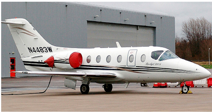
Beechjet 400 Engine Covers