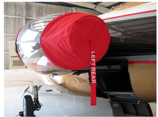
Nextant 400XTi Engine Covers