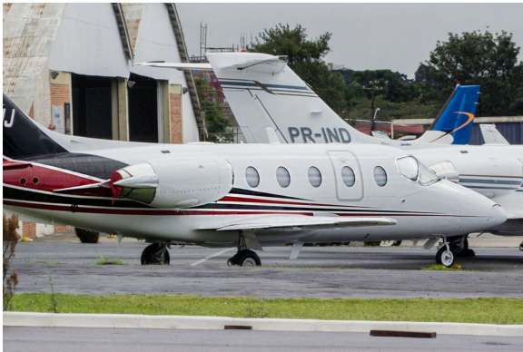
Beechjet Engine Plugs and Cockpit Heatshields