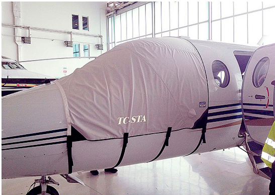
Beechjet 400A Cockpit Cover