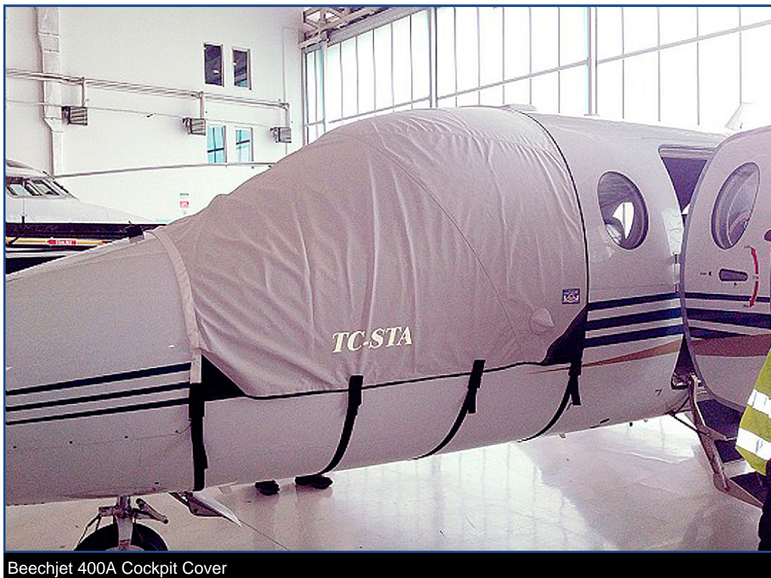
Beechjet 400A Cockpit Cover