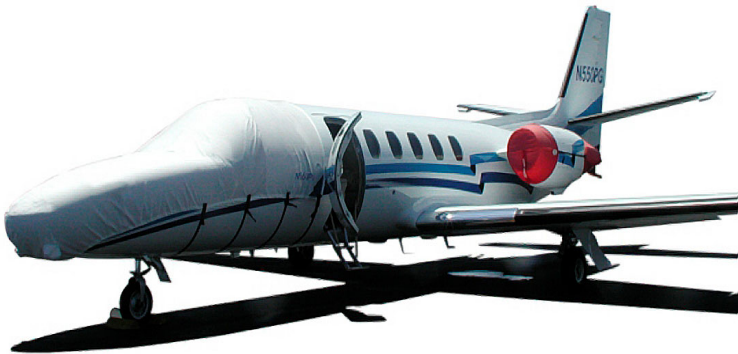
Cessna Citation Nose/Cockpit Cover, Engine Covers

This cover type is made from Silver Acrylic Sunbrella canvas and is 100% lined with a soft and smooth microfiber. Bruce's Custom Covers developed this material combination especially for aircraft protection. The outer material is medium weight and treated for water resistance, UV resistance and anti-static buildup. The inner lining is a very soft and smooth microfiber to prevent scratching. The material is very reflective, and tests show that the cabin interior temperature can be reduced to near-ambient temperature on the hottest of days. It is water, ice and snow repellent, yet breathable to allow moisture to escape from between the cover and the aircraft surface.