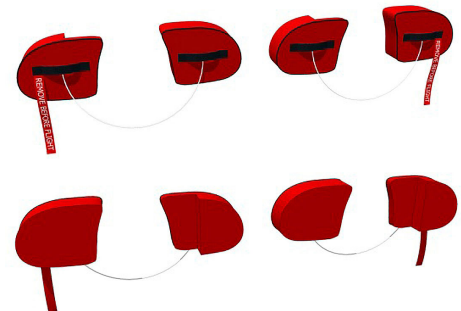
Cessna 414A Engine Plugs