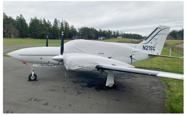
Cessna 421C Canopy & Engine Covers