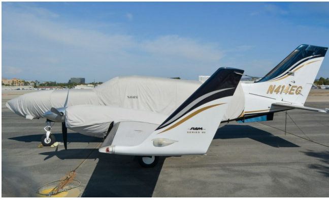
Cessna 414A Extended Canopy/Nose Cover & Engine Covers