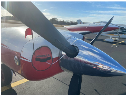
Cessna 401A Engine Inlet Plugs

Engine Inlet Plugs are custom fit for your Cessna 401 intakes, made with heavy-duty vinyl material, and stuffed with a single block of sculpted urethane foam. Each plug has a zipper that allows the foam to be removed and dried if necessary. Engine plugs have warning flags that are visible from the cockpit or 'remove before flight' streamers sewn onto the face of the plugs. Most plugs are imprinted with the aircraft registration number in black for an extra charge. Storage bag NOT included. Engine plugs may be inserted after flight when the engine is still warm. Engine Inlet Plugs are commonly referred to as Cowl Plugs, Intake Plugs, Cowl Blocks, Engine Blocks, and Engine Bungs.