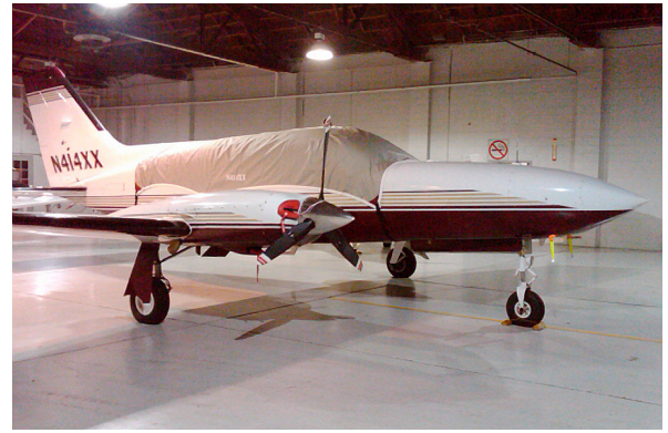
Cessna 414 Canopy Cover and Engine Inlet Plugs