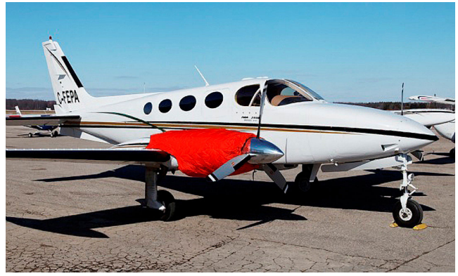
Cessna 340 Insulated Engine Covers