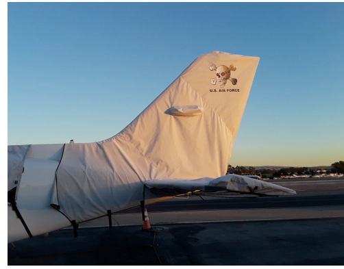
Cessna 421 Empennage Cover