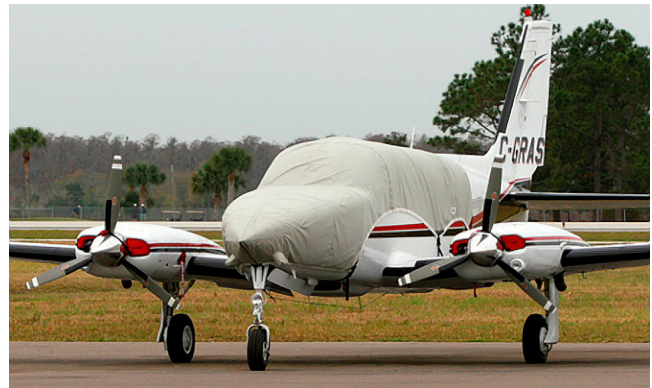
Cessna 340 Canopy/Nose Cover & Engine Inlet Plugs