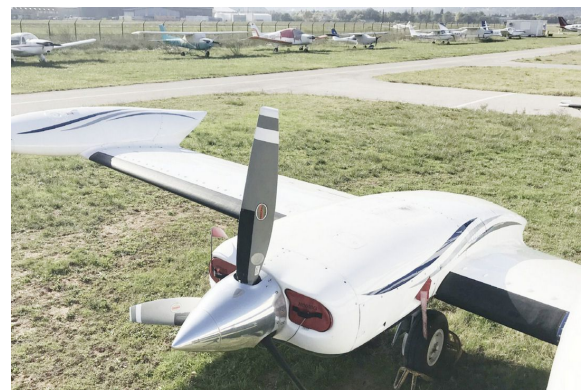
Cessna 340 Engine Inlet Plugs