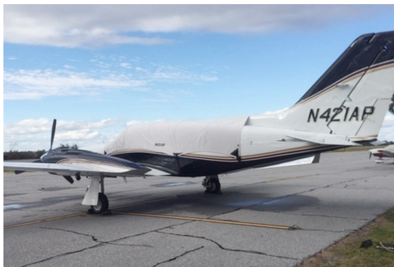
Cessna 421 Canopy Cover