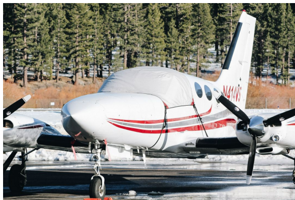
Cessna 414 Cockpit Cover