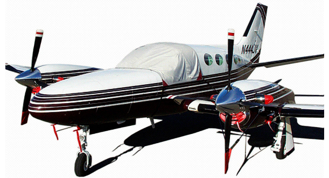
Cessna 425 Cockpit Cover