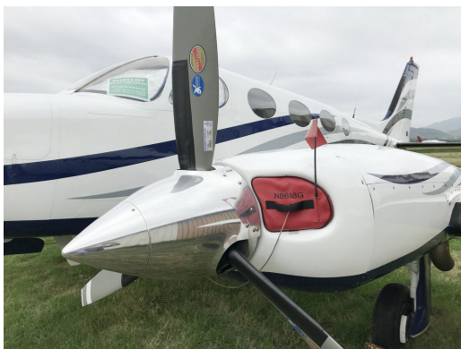
Cessna 340 Engine Inlet Plugs

Engine Inlet Plugs are custom fit for your Cessna 411 intakes, made with heavy-duty vinyl material, and stuffed with a single block of sculpted urethane foam. Each plug has a zipper that allows the foam to be removed and dried if necessary. Engine plugs have warning flags that are visible from the cockpit or 'remove before flight' streamers sewn onto the face of the plugs. Most plugs are imprinted with the aircraft registration number in black for an extra charge. Storage bag NOT included. Engine plugs may be inserted after flight when the engine is still warm. Engine Inlet Plugs are commonly referred to as Cowl Plugs, Intake Plugs, Cowl Blocks, Engine Blocks, and Engine Bungs.