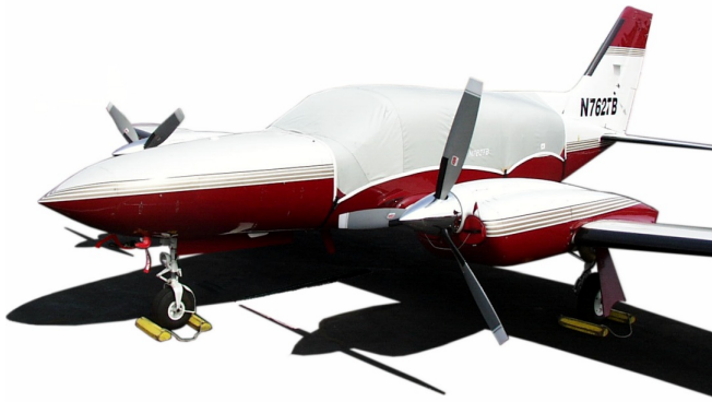
Cessna 421C Canopy Cover & Engine Plugs