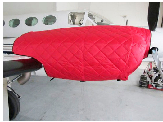
Cessna 421 Insulated Engine Covers