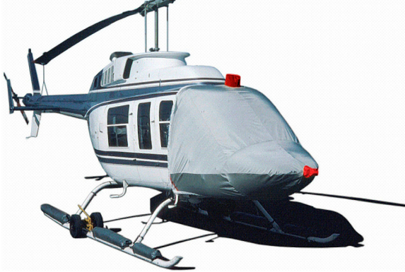
Cockpit Cover on Bell 206L

Travel Covers are made with Silver Solution-Dyed Polyester fabric and fully lined over the entire cover. The material is lightweight and more compact for easy stowage in the aircraft. The polyester material is water resistant, but only intended for occasional use outside. We also have an ultra lightweight material available for fitted hangar dust covers. For daily outdoor use, the non-travel Sunbrella Cover is the best choice.