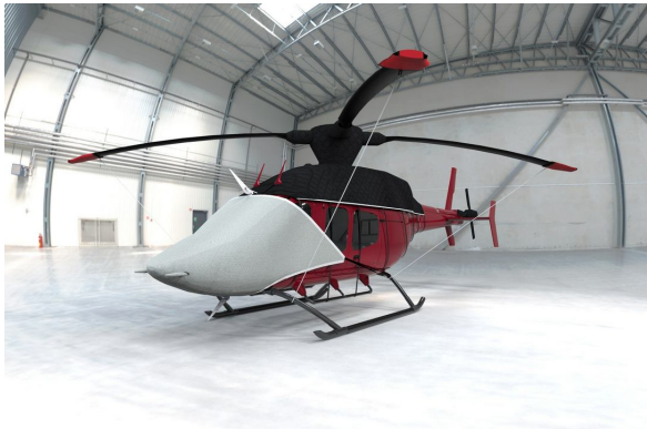
Bell 429 Cockpit/Nose Cover, Engine Cover, etc.