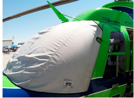
Bell 407 Windshield Cover