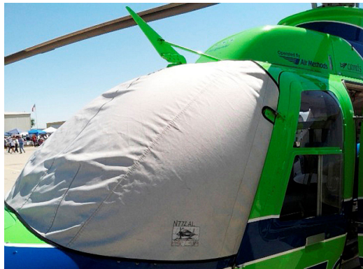
Bell 407 Windshield Cover

Travel Covers are made with Silver Solution-Dyed Polyester fabric and fully lined over the entire cover. The material is lightweight and more compact for easy stowage in the aircraft. The polyester material is water resistant, but only intended for occasional use outside. We also have an ultra lightweight material available for fitted hangar dust covers. For daily outdoor use, the non-travel Sunbrella Cover is the best choice.