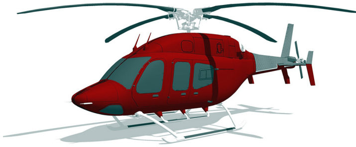
Bell 429 Insulated Tailboom Cover