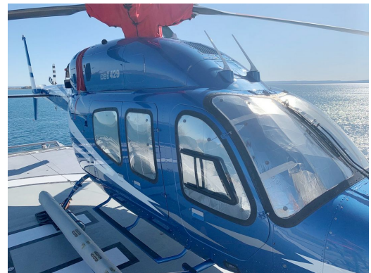
Bell 429 Cockpit & Cabin HeatShields