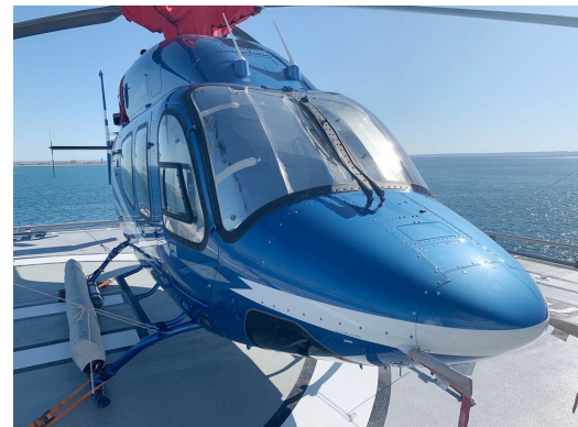
Bell 429 Cockpit HeatShields