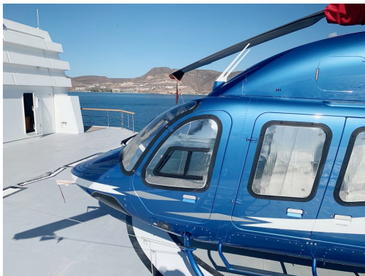
Bell 429 Cockpit & Cabin HeatShields

Cockpit Heatshields are interior sunshades for the aircraft's cockpit. The product is a unique composite of closed-cell foam with a silver mylar finish. The semi-rigid design is stiff enough to stand inside the window framing. Darts and folds are incorporated into the material so that it conforms to the complex shape of the helicopter windows. The set folds up flat and is easily stored in the included storage sleeve. Some designs may require velcro and suction cups. A Heatshield is an excellent short-term remedy for cockpit overheating, but an external fabric cover is more effective for long-term protection.