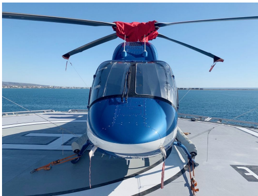
Bell 429 Windshield HeatShields, Rotor Mast Cover

Cockpit Heatshields are interior sunshades for the aircraft's cockpit. The product is a unique composite of closed-cell foam with a silver mylar finish. The semi-rigid design is stiff enough to stand inside the window framing. Darts and folds are incorporated into the material so that it conforms to the complex shape of the helicopter windows. The set folds up flat and is easily stored in the included storage sleeve. Some designs may require velcro and suction cups. A Heatshield is an excellent short-term remedy for cockpit overheating, but an external fabric cover is more effective for long-term protection.