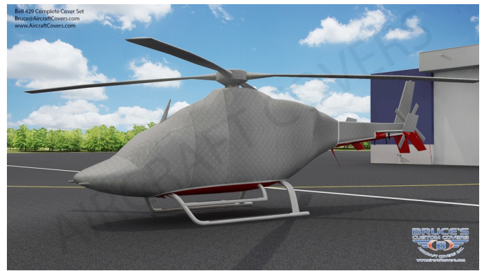
Bell 429 Full Cover Set (3D rendering)