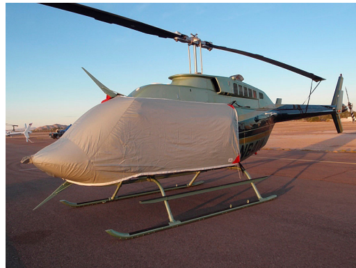
Bell 206L Longranger Bubble Cover