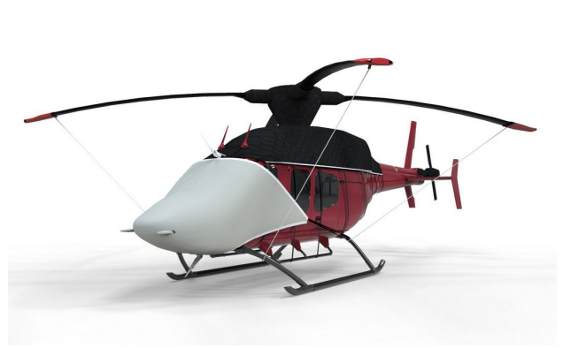
Bell 429 Cockpit/Nose Cover, Engine Cover, etc.