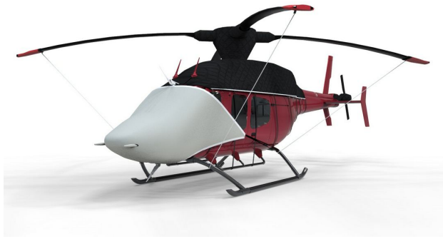
Bell 429 Cockpit/Nose Cover, Engine Cover, etc.