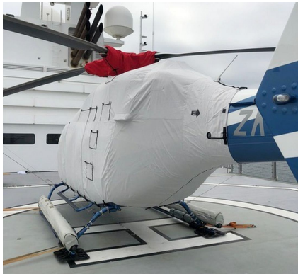
Bell 429 Main Body Cover, Rotor Hub & Tail Rotor Covers

WINTER USE MATERIAL - Made with Solution-Dyed Polyester fabric, this option is intended for seasonal use to aid in deicing, rain mitigation, or for occasional travel. The material is lighter and more compact, but more susceptible to UV damage and may have a shorter useful life if used continuously outside than the all-year use material.