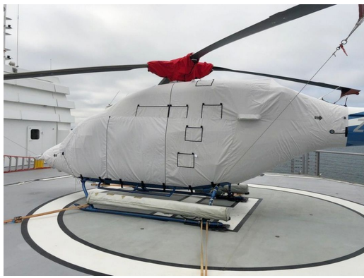
Bell 429 Main Body Cover, Rotor Hub & Tail Rotor Covers