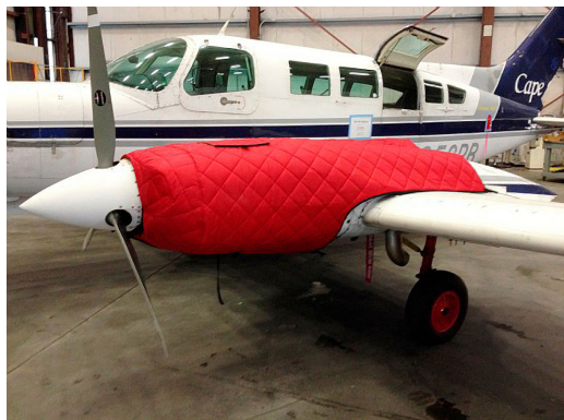
Cessna 402 Insulated Engine Cover

This cover type is made from Silver Acrylic Sunbrella canvas and is 100% lined with a soft and smooth microfiber. Bruce's Custom Covers developed this material combination especially for aircraft protection. The outer material is medium weight and treated for water resistance, UV resistance and anti-static buildup. The inner lining is a very soft and smooth microfiber to prevent scratching. The material is very reflective, and tests show that the cabin interior temperature can be reduced to near-ambient temperature on the hottest of days. It is water, ice and snow repellent, yet breathable to allow moisture to escape from between the cover and the aircraft surface.