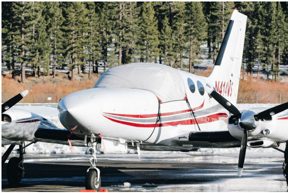
Cessna 414 Cockpit Cover

Covers developed this material combination especially for aircraft protection. The outer material is medium weight and treated for water resistance, UV resistance and anti-static buildup. The inner lining is a very soft and smooth microfiber to prevent scratching. The material is very reflective, and tests show that the cabin interior temperature can be reduced to near-ambient temperature on the hottest of days. It is water, ice and snow repellent, yet breathable to allow moisture to escape from between the cover and the aircraft surface.