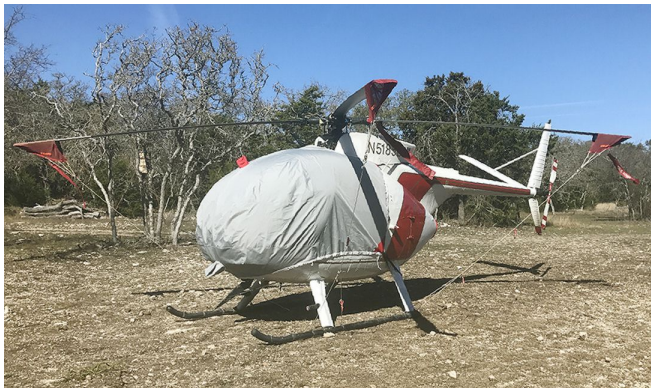
Hughes 500C, OH-6A Bubble Cover

WINTER USE MATERIAL - Made with Solution-Dyed Polyester fabric, this option is intended for seasonal use to aid in deicing, rain mitigation, or for occasional travel. The material is lighter and more compact, but more susceptible to UV damage and may have a shorter useful life if used continuously outside than the all-year use material.