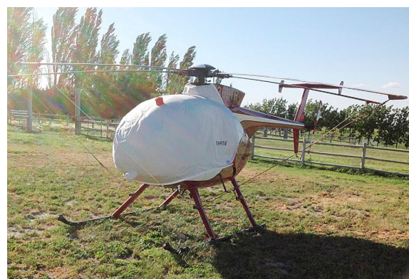
MD500D Bubble Cover with Intake Add-On