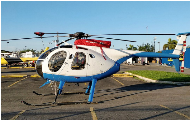
Hughes 500D Blade Tie-Downs, Doghouse Cover