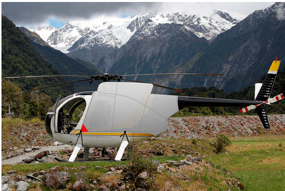
Engine Cover (illustration)

WINTER USE MATERIAL - Made with Solution-Dyed Polyester fabric, this option is intended for seasonal use to aid in deicing, rain mitigation, or for occasional travel. The material is lighter and more compact, but more susceptible to UV damage and may have a shorter useful life if used continuously outside than the all-year use material.