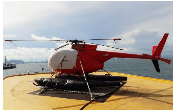
Hughes 500C (369HS) Bubble Cover, Blade Tie-Downs