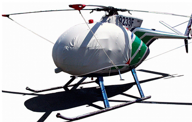
Hughes 500C Bubble Cover with Intake Add-on, Blade Tie-downs