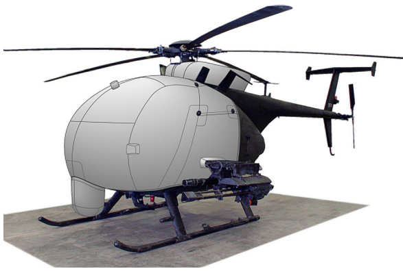
MH-6J Bubble, Flir & Doghouse Covers (illustration)