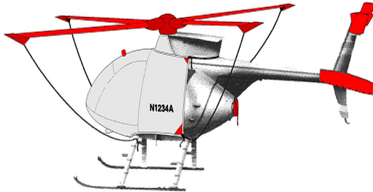
Full Cover Set

The Tailboom Cover details vary by model, but generally the helicopter tail boom cover encloses the tail boom from the "bottleneck" to the aft end. They usually also cover the horizontal stabilizers, and are custom made to allow for antennae, lights, and other protrusions. They attach with straps underneath the tail boom. Covers for the vertical and horizontal stabilizers are also available separately. Specific information for each model is available on request.