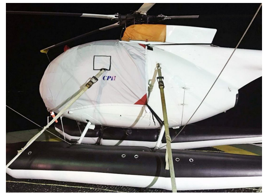
Customized with tie-down access flaps