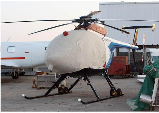
MD-500E Bubble Cover