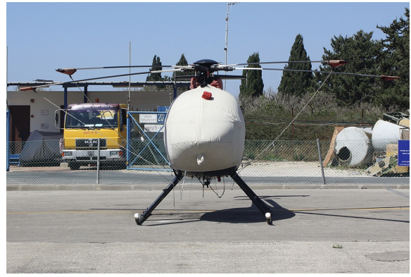
MD-500E Bubble Cover, Blade Tie-Diwns