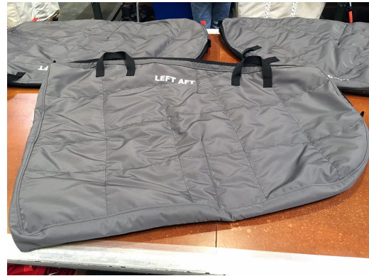
Protective Door Bags