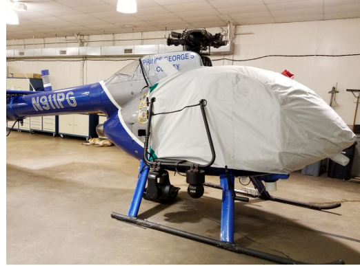
McDonnell Douglas MDD 520 Notar Bubble Cover, with special missions equipment.