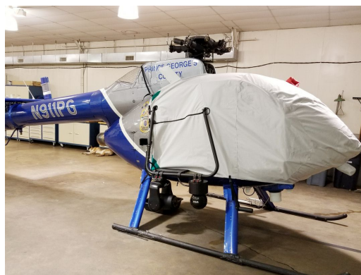
McDonnell Douglas MDD 520 Notar Bubble Cover, with special missions equipment.