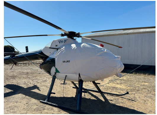
Hughes 500D Bubble Cover with Wire Strike detail and Blade Tie-downs MDD 520 NOTAR Bubble Cover w/Intake Cover Add-On