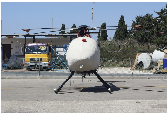
MD-500E Bubble Cover, Blade Tie-Diwns