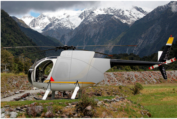
MDD 520 NOTAR Bubble Cover w/Intake Cover Add-On, Exhaust Cover