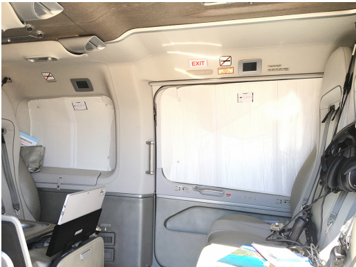
Eurocopter EC-145 Cabin Heatshields