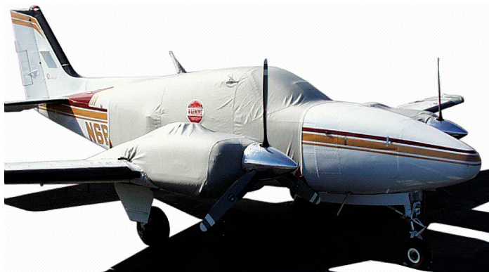
Standard Canopy Cover & Engine Plugs. Extended Canopy Cover & Engine Cover

This cover type is made from Silver Acrylic Sunbrella canvas and is 100% lined with a soft and smooth microfiber. Bruce's Custom Covers developed this material combination especially for aircraft protection. The outer material is medium weight and treated for water resistance, UV resistance and anti-static buildup. The inner lining is a very soft and smooth microfiber to prevent scratching. The material is very reflective, and tests show that the cabin interior temperature can be reduced to near-ambient temperature on the hottest of days. It is water, ice and snow repellent, yet breathable to allow moisture to escape from between the cover and the aircraft surface.