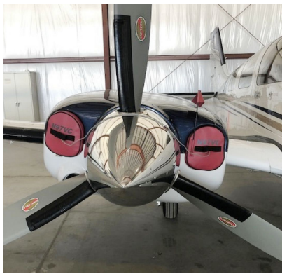
Beech Baron 58P Engine Inlet Plugs

Engine Inlet Plugs are custom fit for your Beech Baron 58P intakes, made with heavy-duty vinyl material, and stuffed with a single block of sculpted urethane foam. Each plug has a zipper that allows the foam to be removed and dried if necessary. Engine plugs have warning flags that are visible from the cockpit or 'remove before flight' streamers sewn onto the face of the plugs. Most plugs are imprinted with the aircraft registration number in black for an extra charge. Storage bag NOT included. Engine plugs may be inserted after flight when the engine is still warm. Engine Inlet Plugs are commonly referred to as Cowl Plugs, Intake Plugs, Cowl Blocks, Engine Blocks, and Engine Bungs.