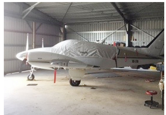
Beech Baron B-55 Canopy Cover