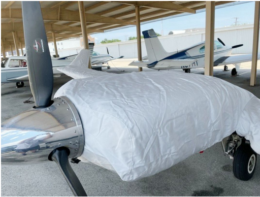
Beech Baron 58P Wing/Engine Covers (test fit)

WINTER USE MATERIAL - Made with Solution-Dyed Polyester fabric, this option is intended for seasonal use to aid in deicing, rain mitigation, or for occasional travel. The material is lighter and more compact, but more susceptible to UV damage and may have a shorter useful life if used continuously outside than the all-year use material.