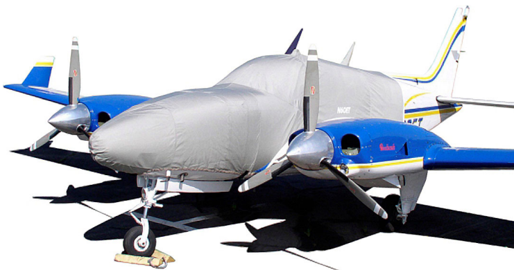
Baron Canopy/Nose Cover

Travel Covers are made with Silver Solution-Dyed Polyester fabric and only lined over the windshield to save weight. The material is lightweight and more compact for easy stowage in the aircraft. The polyester material is water resistant, but only intended for occasional use outside. We also have an ultra lightweight material available for fitted hangar dust covers. For daily outdoor use, the non-travel Sunbrella Cover is the best choice.