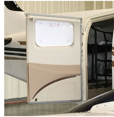
Beech Baron 58 Cabin HeatShield