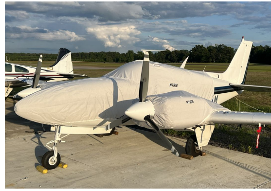
Beech C55 Baron Extended Canopy/Nose Cover, Engine Covers