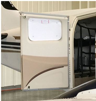
Beech Baron 58 Cabin HeatShield

Windshield Heatshields are interior sunshades for an aircraft's front windshield. The product is a unique composite of closed-cell foam with a silver mylar finish. The semi-rigid design is stiff enough to stand along the inside of the windshield using sun visors or window framing. It folds up flat and easily stores in the included storage sleeve. Some designs may require velcro and suction cups or split right and left sides. A Heatshield is an excellent short-term remedy for cockpit overheating. An external fabric cover is far more effective and practical for long-term protection.