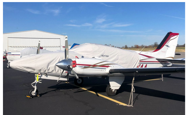
Baron Beech E-55 Extended Canopy/Nose Cover