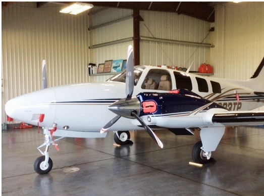
Beech Baron 58 Engine Inlet Plugs, Cowl Top Plugs, Heater Inlet, Pitot Cover

Engine Inlet Plugs are custom fit for your Beech Baron 58TC intakes, made with heavy-duty vinyl material, and stuffed with a single block of sculpted urethane foam. Each plug has a zipper that allows the foam to be removed and dried if necessary. Engine plugs have warning flags that are visible from the cockpit or 'remove before flight' streamers sewn onto the face of the plugs. Most plugs are imprinted with the aircraft registration number in black for an extra charge. Storage bag NOT included. Engine plugs may be inserted after flight when the engine is still warm. Engine Inlet Plugs are commonly referred to as Cowl Plugs, Intake Plugs, Cowl Blocks, Engine Blocks, and Engine Bungs.