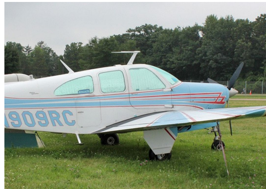
Beech Bonanza/Debonair HeatShield Set