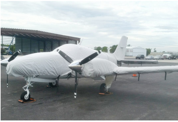
Full Cover Set (58P-020, 58P-225, 58P-405)