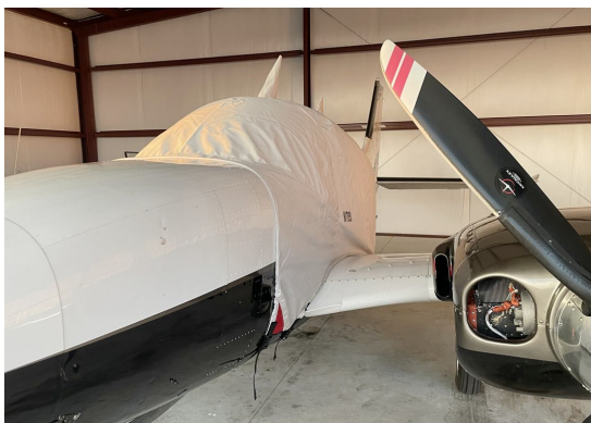
Beech Baron 58TC Extended Canopy Cover

This cover type is made from Silver Acrylic Sunbrella canvas and is 100% lined with a soft and smooth microfiber. Bruce's Custom Covers developed this material combination especially for aircraft protection. The outer material is medium weight and treated for water resistance, UV resistance and anti-static buildup. The inner lining is a very soft and smooth microfiber to prevent scratching. The material is very reflective, and tests show that the cabin interior temperature can be reduced to near-ambient temperature on the hottest of days. It is water, ice and snow repellent, yet breathable to allow moisture to escape from between the cover and the aircraft surface.