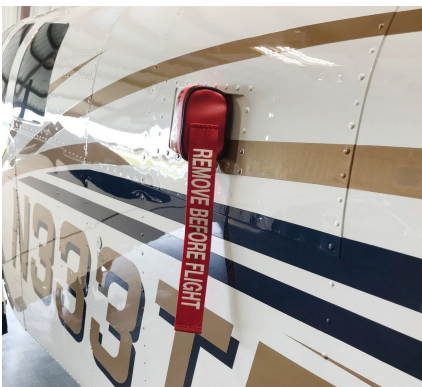
Beech Baron Fresh Air Outlet Plug

Engine Inlet Plugs are custom fit for your Beech Baron 58TC intakes, made with heavy-duty vinyl material, and stuffed with a single block of sculpted urethane foam. Each plug has a zipper that allows the foam to be removed and dried if necessary. Engine plugs have warning flags that are visible from the cockpit or 'remove before flight' streamers sewn onto the face of the plugs. Most plugs are imprinted with the aircraft registration number in black for an extra charge. Storage bag NOT included. Engine plugs may be inserted after flight when the engine is still warm. Engine Inlet Plugs are commonly referred to as Cowl Plugs, Intake Plugs, Cowl Blocks, Engine Blocks, and Engine Bungs.