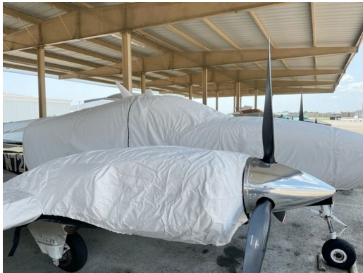
Beech Baron 58P Extended Canopy/Nose Cover, Wing/Engine Covers (test fit)

WINTER USE MATERIAL - Made with Solution-Dyed Polyester fabric, this option is intended for seasonal use to aid in deicing, rain mitigation, or for occasional travel. The material is lighter and more compact, but more susceptible to UV damage and may have a shorter useful life if used continuously outside than the all-year use material.