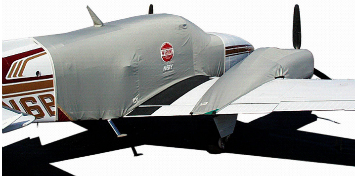
Baron Extended Canopy Cover & Engine Covers

This cover type is made from Silver Acrylic Sunbrella canvas and is 100% lined with a soft and smooth microfiber. Bruce's Custom Covers developed this material combination especially for aircraft protection. The outer material is medium weight and treated for water resistance, UV resistance and anti-static buildup. The inner lining is a very soft and smooth microfiber to prevent scratching. The material is very reflective, and tests show that the cabin interior temperature can be reduced to near-ambient temperature on the hottest of days. It is water, ice and snow repellent, yet breathable to allow moisture to escape from between the cover and the aircraft surface.