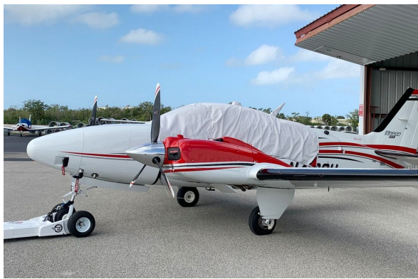
Beech Baron G58 Canopy Cover