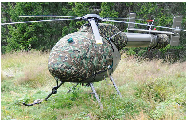
MD520 NOTAR Bubble, Engine, & NOTAR Covers & Blade Tie-downs