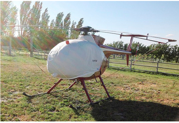
MD500D Bubble Cover with Intake Add-On