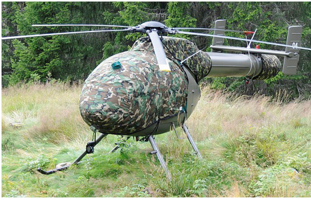
MD520 NOTAR Bubble, Engine, & NOTAR Covers & Blade Tie-downs