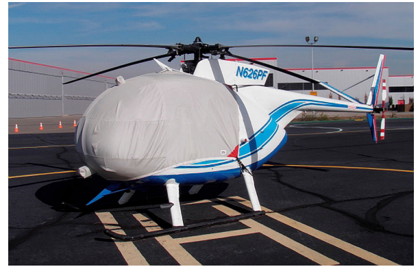
MD500C Bubble Cover with Wire Strike detail