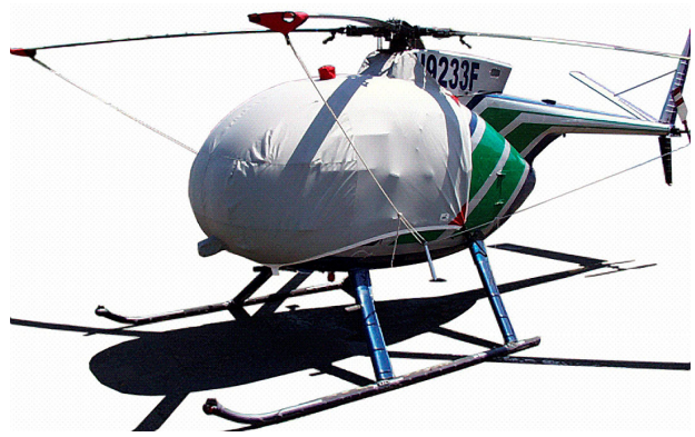
Hughes 500C Bubble Cover with Intake Add-on, Blade Tie-downs