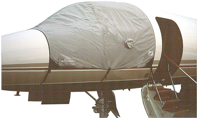
Falcon 50 Windshield Cover

This cover type is made from Silver Acrylic Sunbrella canvas and is 100% lined with a soft and smooth microfiber. Bruce's Custom Covers developed this material combination especially for aircraft protection. The outer material is medium weight and treated for water resistance, UV resistance and anti-static buildup. The inner lining is a very soft and smooth microfiber to prevent scratching. The material is very reflective, and tests show that the cabin interior temperature can be reduced to near-ambient temperature on the hottest of days. It is water, ice and snow repellent, yet breathable to allow moisture to escape from between the cover and the aircraft surface.