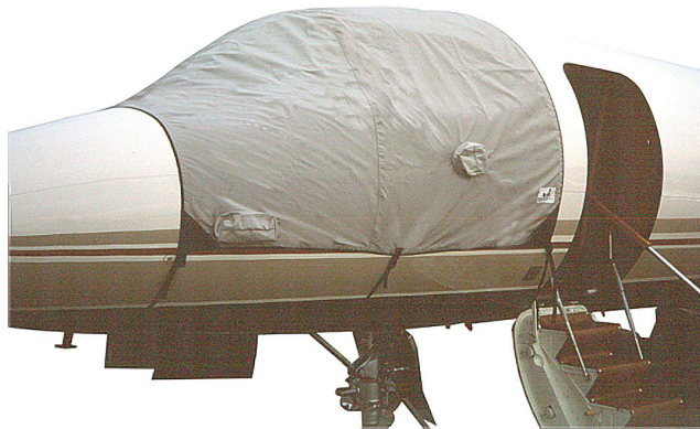
Falcon 50 Windshield Cover

This cover type is made from Silver Acrylic Sunbrella canvas and is 100% lined with a soft and smooth microfiber. Bruce's Custom Covers developed this material combination especially for aircraft protection. The outer material is medium weight and treated for water resistance, UV resistance and anti-static buildup. The inner lining is a very soft and smooth microfiber to prevent scratching. The material is very reflective, and tests show that the cabin interior temperature can be reduced to near-ambient temperature on the hottest of days. It is water, ice and snow repellent, yet breathable to allow moisture to escape from between the cover and the aircraft surface.