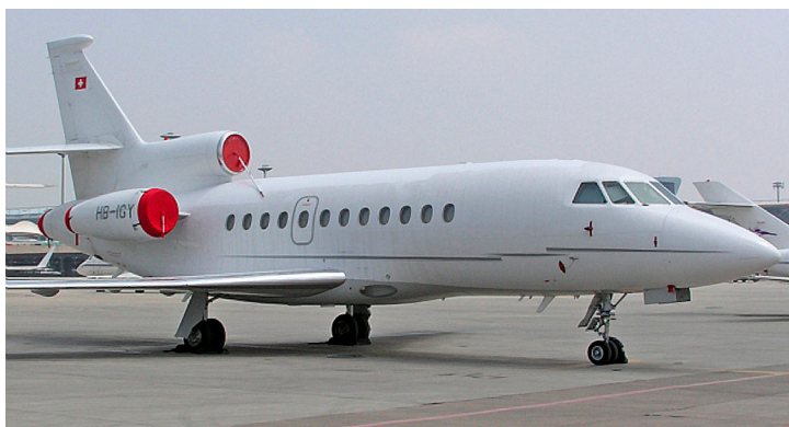
Falcon 900 Engine Covers, hook detail