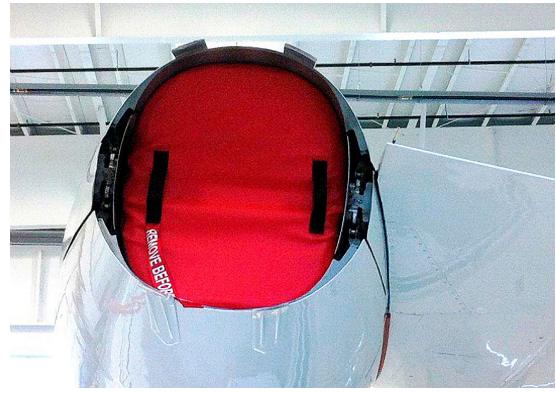
Falcon 2000EX Exhaust Plug