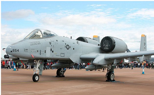
A-10 Engine Covers with Custom Artwork

ALL-YEAR USE MATERIAL - Made with Solution dyed Polyester fabric, the all-year use material is the best option for sun protection and cover longevity. This heavier more durable material is intended for all weather conditions, such as rain and snow or lots of sun.