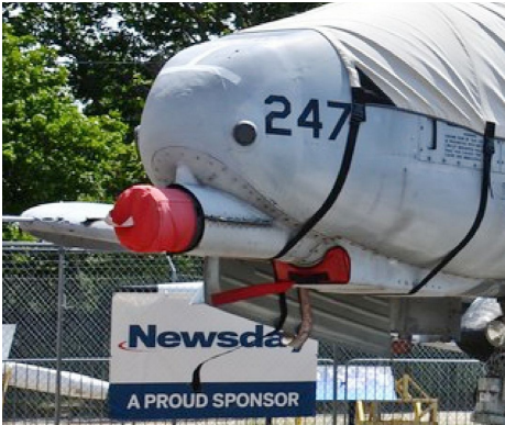
Fairchild A10 Thunderbolt Nose Gun Cover, Gun Scoop Inlet Plug