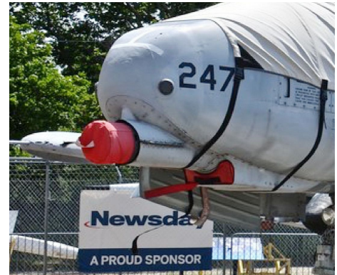
Fairchild A10 Thunderbolt Nose Gun Cover, Gun Scoop Inlet Plug