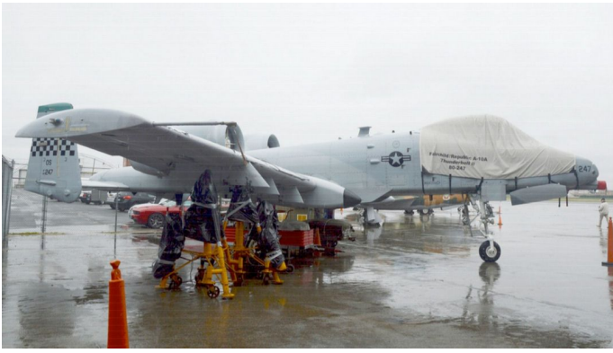
Fairchild A10 Thunderbolt Canopy Cover