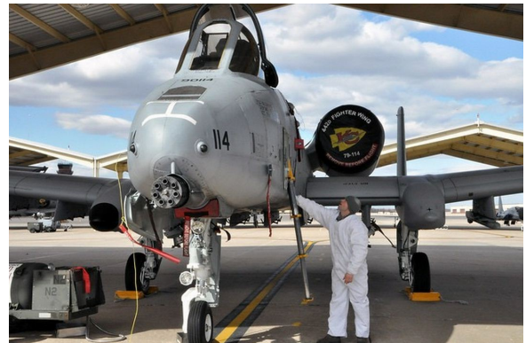
Fairchild A10 Intake Covers & Nose Gun Scoop Plug