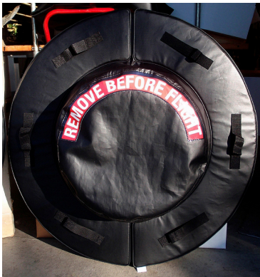
A-10 Exhaust Plug/Cover

The Engine Inlet Plugs are custom fit for your Fairchild A10 Thunderbolt intakes, made with heavy-duty vinyl material, and stuffed with a single block of sculpted urethane foam. Each plug has a zipper that allows the foam to be removed and dried if necessary. Engine plugs have 'remove before flight' streamers sewn onto the face of the plugs. Most plugs are imprinted with the aircraft registration number in black for an extra charge. Storage bag NOT included. Engine plugs may be inserted after flight when the engine is still warm. Engine Inlet Plugs are commonly referred to as Cowl Plugs, Intake Plugs, Cowl Blocks, Engine Blocks, and Engine Bungs.