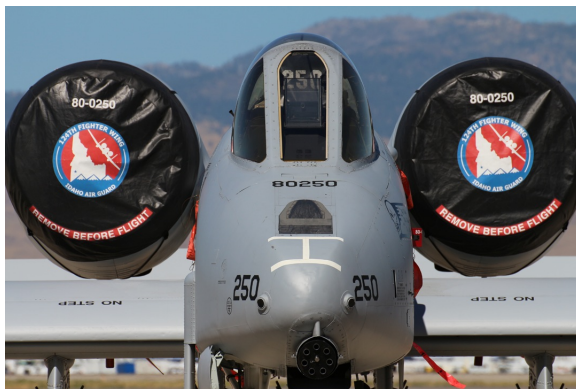
A-10 Engine Covers

ALL-YEAR USE MATERIAL - Made with Solution dyed Polyester fabric, the all-year use material is the best option for sun protection and cover longevity. This heavier more durable material is intended for all weather conditions, such as rain and snow or lots of sun.