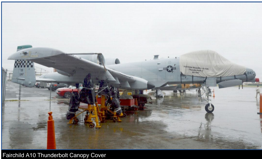
Fairchild A10 Thunderbolt Canopy Cover