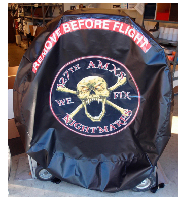
A-10 Engine Intake Cover