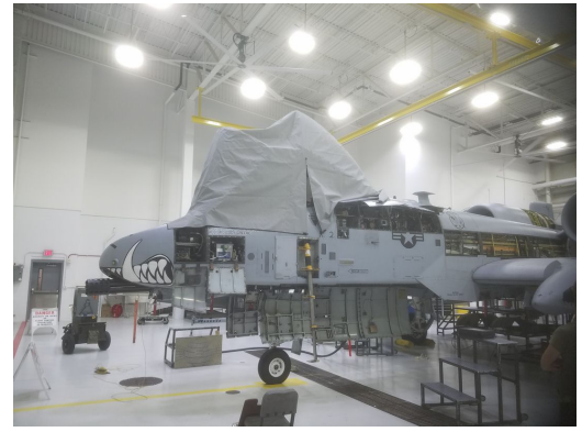
Fairchild A-10 Canopy Cover, open position