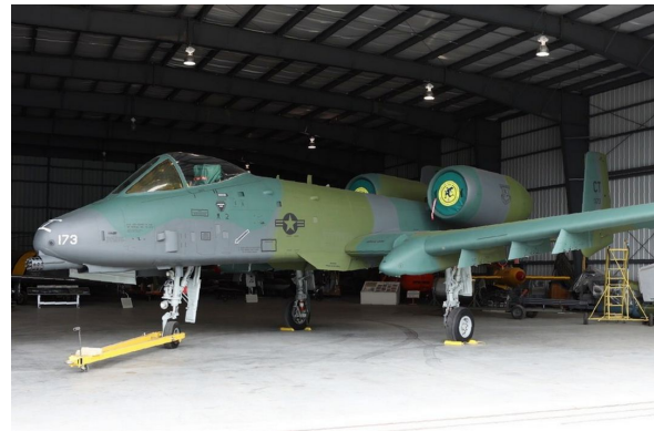
Fairchild A10 Intake Plugs, non-folding type