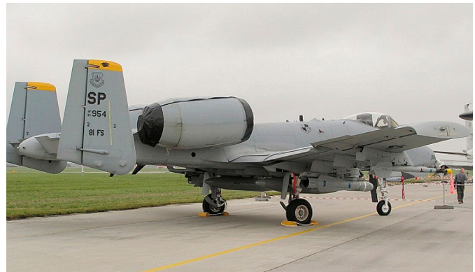
A-10 Engine Covers