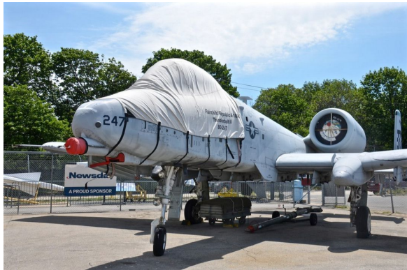
Fairchild A10 Thunderbolt Canopy Cover, Nose Gun Cover, Gun Scoop Inlet Plug

ALL-YEAR USE MATERIAL - Made with Silver Acrylic Sunbrella canvas, the all-year use material is the best option for sun protection and cover longevity. This heavier more durable material is intended for all weather conditions, such as rain and snow or lots of sun.