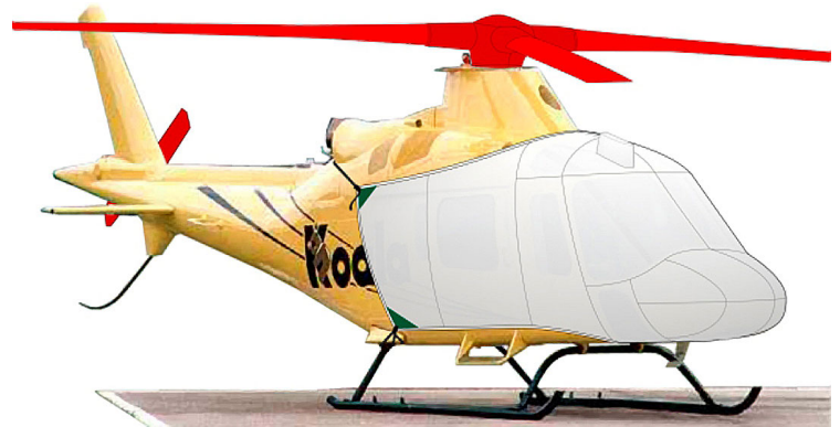
Koala Bubble, Rotor Hub, Blade & Tail Rotor Covers (illustration)