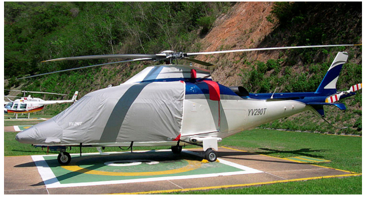
Agusta Grand Bubble Cover