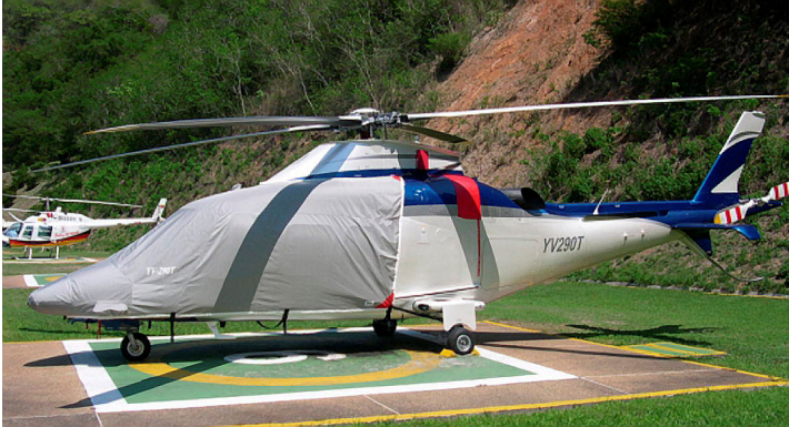
Agusta Grand Bubble Cover

Travel Covers are made with Silver Solution-Dyed Polyester fabric and fully lined over the entire cover. The material is lightweight and more compact for easy storage in the aircraft. The polyester material is water resistant, but only intended for occasional use outside. We also have an ultra lightweight material available for fitted hangar dust covers. For daily outdoor use, the non-travel Sunbrella Cover is the best choice.