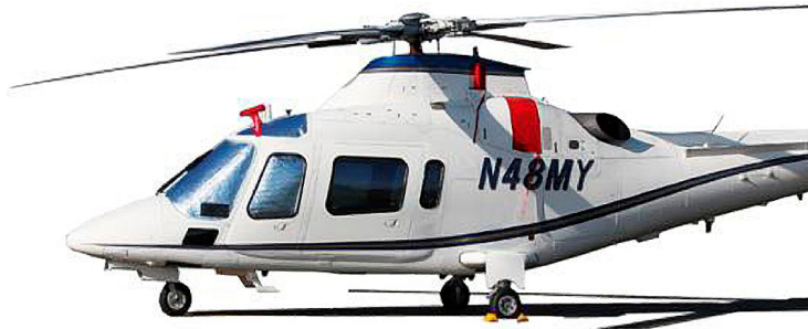
Agusta Power Pitot Covers, Intake Covers, and Cockpit Heatshield set