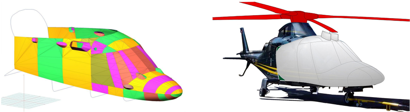
Agusta Leonardo A169 Bubble Cover with Wire Strike, 3D model Agusta 109 Bubble, Rotor Hub & Blade Covers (illustration)

Travel Covers are made with Silver Solution-Dyed Polyester fabric and fully lined over the entire cover. The material is lightweight and more compact for easy stowage in the aircraft. The polyester material is water resistant, but only intended for occasional use outside. We also have an ultra lightweight material available for fitted hangar dust covers. For daily outdoor use, the non-travel Sunbrella Cover is the best choice.