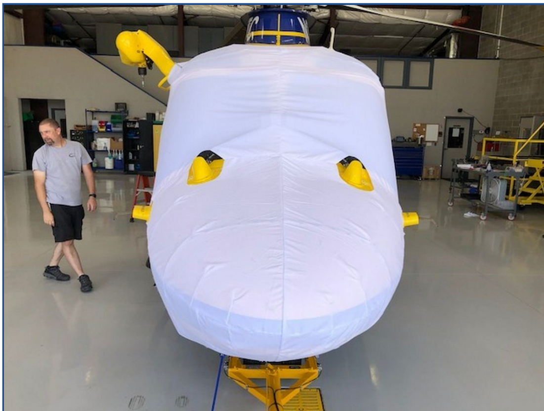
Leonardo (Agusta) A-169 Bubble Cover, test fit cover