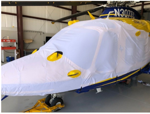
Leonardo (Agusta) A-169 Bubble Cover, test fit cover