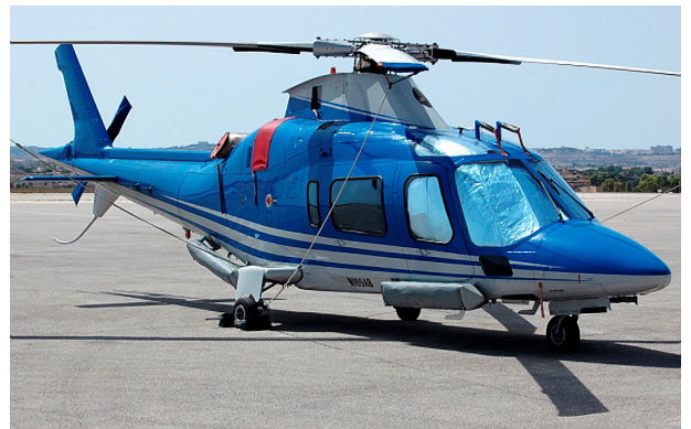
Agusta Power Cockpit HeatShields & Blade Tie-downs