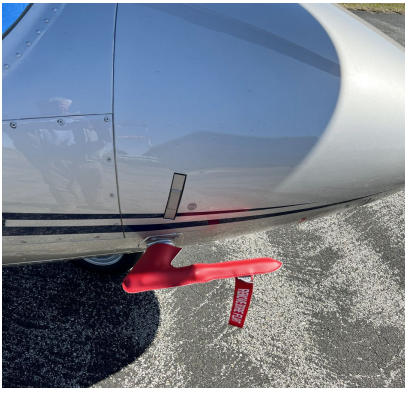
Agusta AW109 (A, C, & Trekker) Pitot Cover Set