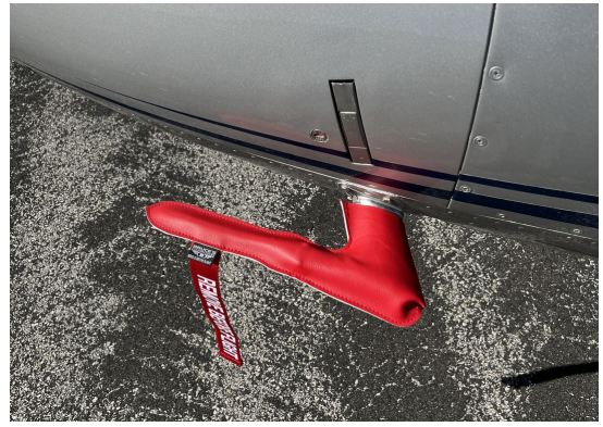
Agusta AW109 (A, C, & Trekker) Pitot Cover Set