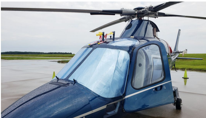
Agusta AW109S/SP Grand Heatshield Set

Cockpit Heatshields are interior sunshades for the aircraft's cockpit. The product is a unique composite of closed-cell foam with a silver mylar finish. The semi-rigid design is stiff enough to stand inside the window framing. Darts and folds are incorporated into the material so that it conforms to the complex shape of the helicopter windows. The set folds up flat and is easily stored in the included storage sleeve. Some designs may require velcro and suction cups. A Heatshield is an excellent short-term remedy for cockpit overheating, but an external fabric cover is more effective for long-term protection.