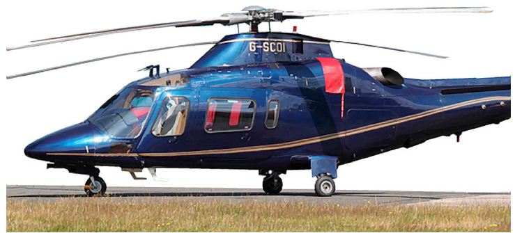
Agusta Power Intake Cover