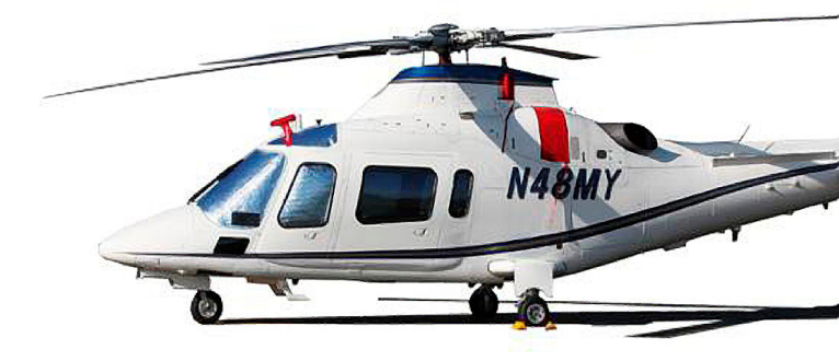
Agusta Power Pitot Covers, Intake Covers, and Cockpit Heatshield set

WINTER USE MATERIAL - Made with Solution-Dyed Polyester fabric, this option is intended for seasonal use to aid in deicing, rain mitigation, or for occasional travel. The material is lighter and more compact, but more susceptible to UV damage and may have a shorter useful life if used continuously outside than the all-year use material.