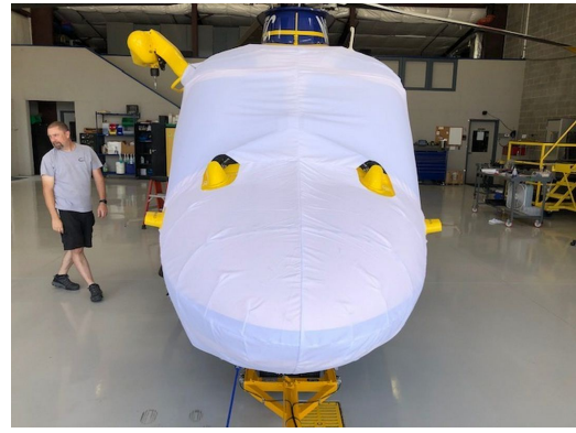
Leonardo (Agusta) A-169 Bubble Cover, test fit cover