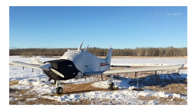
Beech Sport Insulated Engine Cover & Winter Cover Set

This cover type is made from Silver Acrylic Sunbrella canvas and is 100% lined with a soft and smooth microfiber. Bruce's Custom Covers developed this material combination especially for aircraft protection. The outer material is medium weight and treated for water resistance, UV resistance and anti-static buildup. The inner lining is a very soft and smooth microfiber to prevent scratching. The material is very reflective, and tests show that the cabin interior temperature can be reduced to near-ambient temperature on the hottest of days. It is water, ice and snow repellent, yet breathable to allow moisture to escape from between the cover and the aircraft surface.