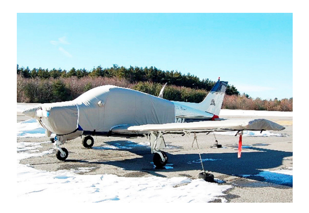
Prop, Engine, Extended Canopy, Wing, Tailcone, and Horizontal Stab Covers