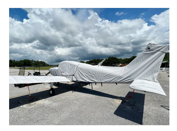
Beech Musketeer A23 Cover Set