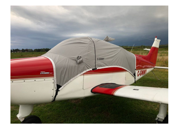
Beech Sundowner Travel Canopy Cover

Travel Covers are made with Silver Solution-Dyed Polyester fabric and only lined over the windshield to save weight. The material is lightweight and more compact for easy stowage in the aircraft. The polyester material is water resistant, but only intended for occasional use outside. We also have an ultra lightweight material available for fitted hangar dust covers. For daily outdoor use, the non-travel Sunbrella Cover is the best choice.