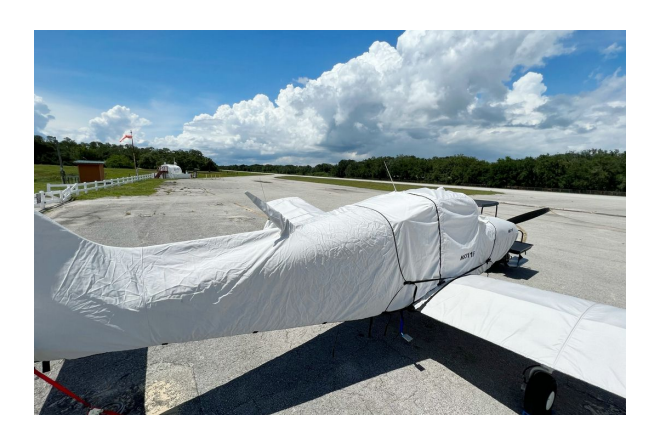
Beech Musketeer A23 Cover Set