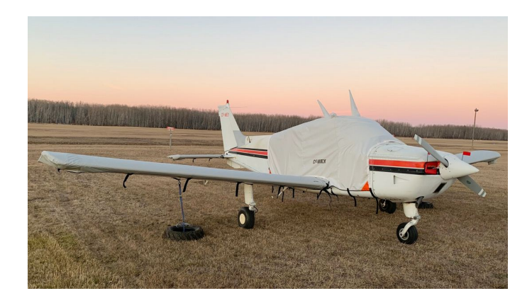
Sport B19 Engine Inlet Plugs