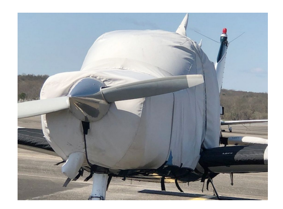
Beech Sundowner Engine Cover

This cover type is made from Silver Acrylic Sunbrella canvas and is 100% lined with a soft and smooth microfiber. Bruce's Custom Covers developed this material combination especially for aircraft protection. The outer material is medium weight and treated for water resistance, UV resistance and anti-static buildup. The inner lining is a very soft and smooth microfiber to prevent scratching. The material is very reflective, and tests show that the cabin interior temperature can be reduced to near-ambient temperature on the hottest of days. It is water, ice and snow repellent, yet breathable to allow moisture to escape from between the cover and the aircraft surface.