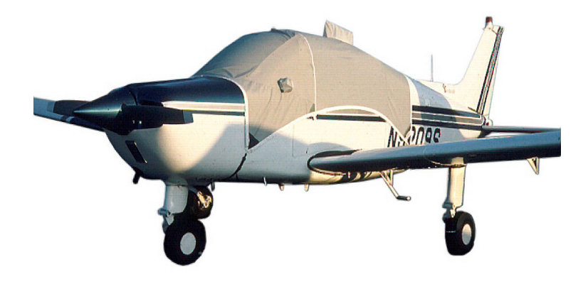
Beech Sport Canopy Cover