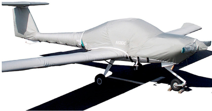
Diamond DA-20 Full Cover Set

This cover type is made from Silver Acrylic Sunbrella canvas and is 100% lined with a soft and smooth microfiber. Bruce's Custom Covers developed this material combination especially for aircraft protection. The outer material is medium weight and treated for water resistance, UV resistance and anti-static buildup. The inner lining is a very soft and smooth microfiber to prevent scratching. The material is very reflective, and tests show that the cabin interior temperature can be reduced to near-ambient temperature on the hottest of days. It is water, ice and snow repellent, yet breathable to allow moisture to escape from between the cover and the aircraft surface.