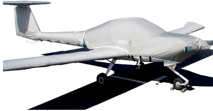
Diamond DA-20 Full Cover Set

WINTER USE MATERIAL - Made with Solution-Dyed Polyester fabric, this option is intended for seasonal use to aid in deicing, rain mitigation, or for occasional travel. The material is lighter and more compact, but more susceptible to UV damage and may have a shorter useful life if used continuously outside than the all-year use material.