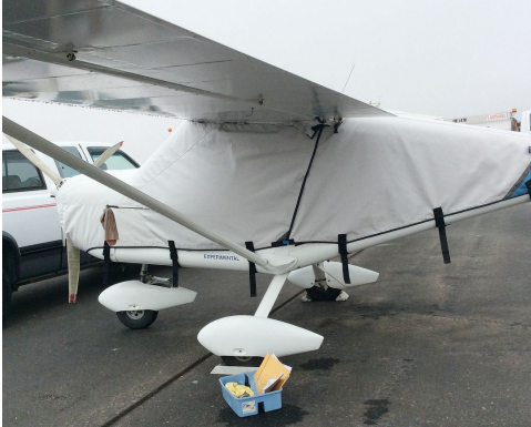
Aeroprakt A-22 Valor Capetown, Foxbat Canopy/Engine Cover