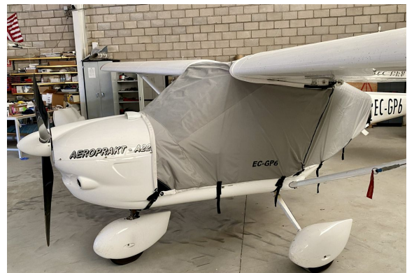
Aeroprakt A22 Over-Top Canopy Cover