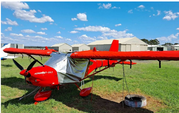
Aeroprakt A22 Wing & Empennage Covers

WINTER USE MATERIAL - Made with Solution-Dyed Polyester fabric, this option is intended for seasonal use to aid in deicing, rain mitigation, or for occasional travel. The material is lighter and more compact, but more susceptible to UV damage and may have a shorter useful life if used continuously outside than the all-year use material.