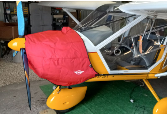
Aeroprakt A-22 Insulated Engine Cover

Insulated Covers Material - A special composite material of solution-dyed polyester, 3M Thinsulate insulation, and soft nylon interior fabric. Our insulated covers are designed to complement an engine preheater and help retain heat in the engine compartment after shutdown. If you operate your aircraft in cold-weather, these covers will help prevent engine wear and tear.