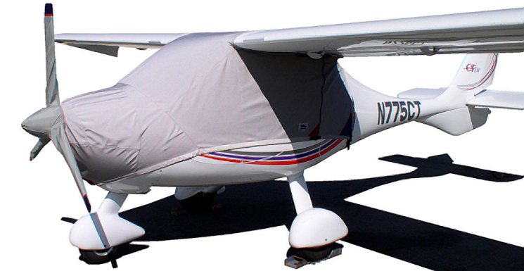
Flight Design CT Canopy/Engine Cover

This cover type is made from Silver Acrylic Sunbrella canvas and is 100% lined with a soft and smooth microfiber. Bruce's Custom Covers developed this material combination especially for aircraft protection. The outer material is medium weight and treated for water resistance, UV resistance and anti-static buildup. The inner lining is a very soft and smooth microfiber to prevent scratching. The material is very reflective, and tests show that the cabin interior temperature can be reduced to near-ambient temperature on the hottest of days. It is water, ice and snow repellent, yet breathable to allow moisture to escape from between the cover and the aircraft surface.