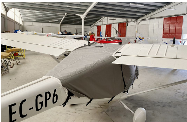
Aeroprakt A22 Over-Top Canopy Cover

Travel Covers are made with Silver Solution-Dyed Polyester fabric and only lined over the windshield to save weight. The material is lightweight and more compact for easy stowage in the aircraft. The polyester material is water resistant, but only intended for occasional use outside. We also have an ultra lightweight material available for fitted hangar dust covers. For daily outdoor use, the non-travel Sunbrella Cover is the best choice.