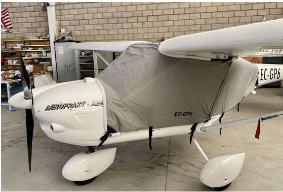
Aeroprakt A22 Over-Top Canopy Cover