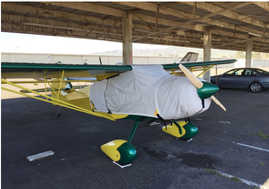
Kitfox Canopy & Engine Covers