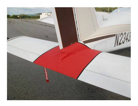
Beech Musketeer Tailcone Cover (Fully Enclosed)