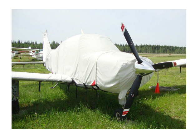
Prop, Engine, Extended Canopy, Wing, Tailcone, and Horizontal Beech Sierra Engine, Extended Canopy, Empennage, & Wing Stab Covers