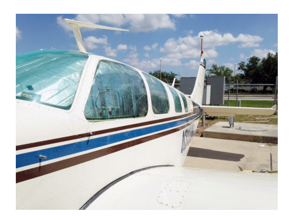
Beech Bonanza HeatShields

Windshield Heatshields are interior sunshades for an aircraft's front windshield. The product is a unique composite of closed-cell foam with a silver mylar finish. The semi-rigid design is stiff enough to stand along the inside of the windshield using sun visors or window framing. It folds up flat and easily stores in the included storage sleeve. Some designs may require velcro and suction cups or split right and left sides. A Heatshield is an excellent short-term remedy for cockpit overheating. An external fabric cover is far more effective and practical for long-term protection.