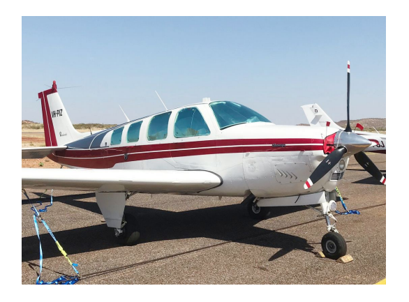
Beech A-36 Bonanza Cabin HeatShields