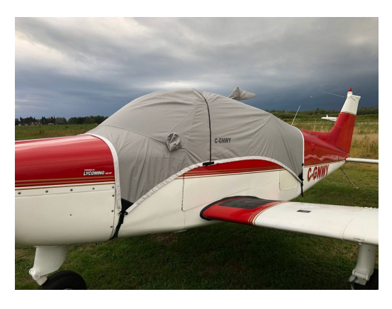
Beech Sundowner Travel Canopy Cover