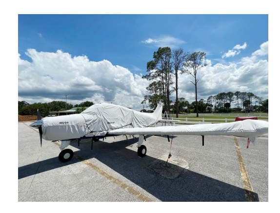
Beech Musketeer A23 Cover Set

WINTER USE MATERIAL - Made with Solution-Dyed Polyester fabric, this option is intended for seasonal use to aid in deicing, rain mitigation, or for occasional travel. The material is lighter and more compact, but more susceptible to UV damage and may have a shorter useful life if used continuously outside than the all-year use material.