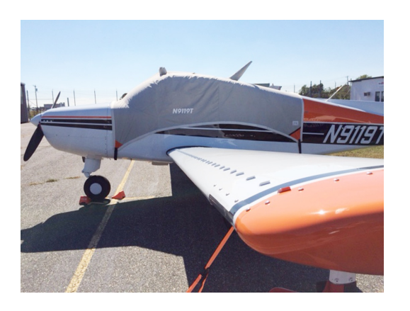
Beech Musketeer Canopy Cover