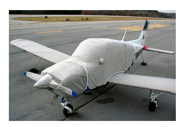
Beech Sundowner Extended Canopy Cover, Fully Enclosed Engine Beech Sierra Extended Canopy, Engine, Prop, Wings, Stab & Cover, Wing Covers Tailcone Covers