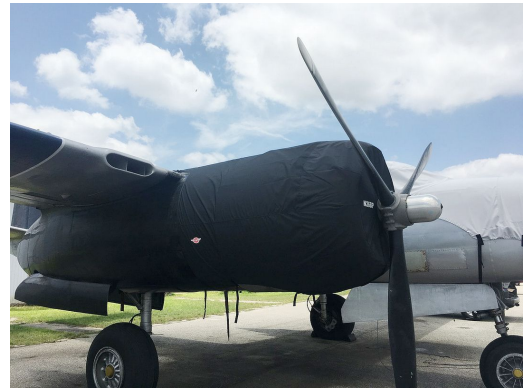
Douglas A-26 Engine Cover