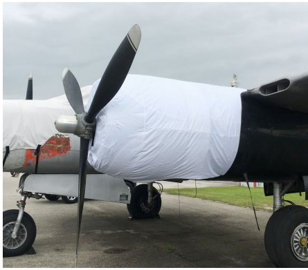
Douglas A-26 Engine Cover, test fit cover