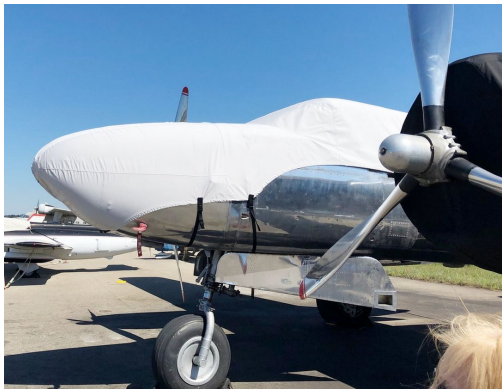
Douglas A26 Invader Cockpit/Nose Cover