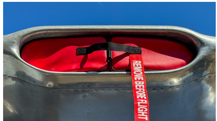
Douglas A26 Invader Oil Cooler Inlet Plugs