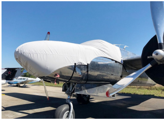
Douglas A26 Invader Cockpit/Nose Cover

the hottest of days. It is water, ice and snow repellent, yet breathable to allow moisture to escape from between the cover and the aircraft surface.