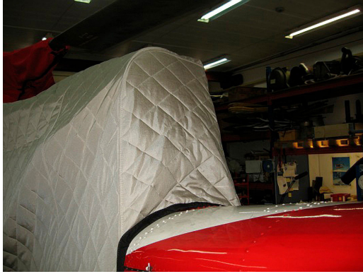
Alouette III Insulated Engine/Transmission Cover

WINTER USE MATERIAL - Made with Solution-Dyed Polyester fabric, this option is intended for seasonal use to aid in deicing, rain mitigation, or for occasional travel. The material is lighter and more compact, but more susceptible to UV damage and may have a shorter useful life if used continuously outside than the all-year use material.