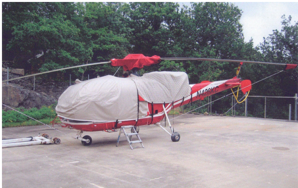
Alouette III Bubble, Rotor Hub & Engine Covers, Blade Tie-Downs

WINTER USE MATERIAL - Made with Solution-Dyed Polyester fabric, this option is intended for seasonal use to aid in deicing, rain mitigation, or for occasional travel. The material is lighter and more compact, but more susceptible to UV damage and may have a shorter useful life if used continuously outside than the all-year use material.