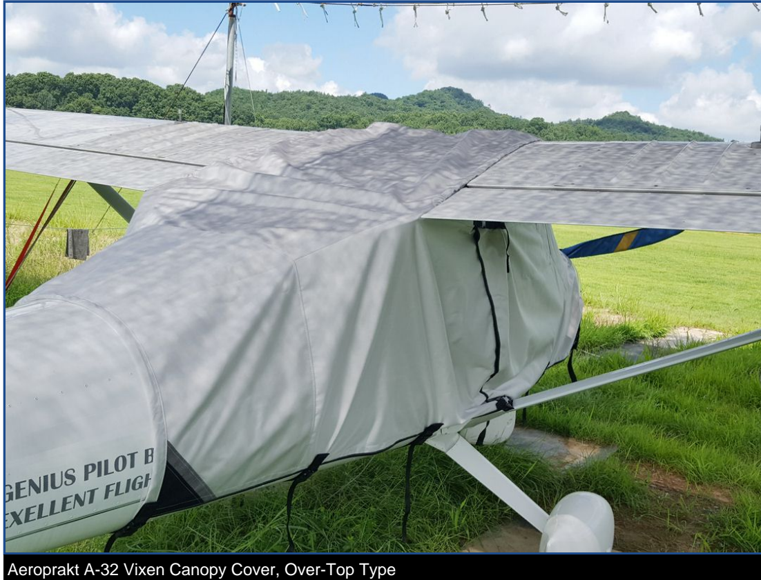
Aeroprakt A-32 Vixxen Canopy Cover, Over-Top Type