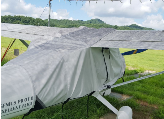
Aeroprakt A-32 Vixen Canopy Cover, Over-Top Type

This cover type is made from Silver Acrylic Sunbrella canvas and is 100% lined with a soft and smooth microfiber. Bruce's Custom Covers developed this material combination especially for aircraft protection. The outer material is medium weight and treated for water resistance, UV resistance and anti-static buildup. The inner lining is a very soft and smooth microfiber to prevent scratching. The material is very reflective, and tests show that the cabin interior temperature can be reduced to near-ambient temperature on the hottest of days. It is water, ice and snow repellent, yet breathable to allow moisture to escape from between the cover and the aircraft surface.