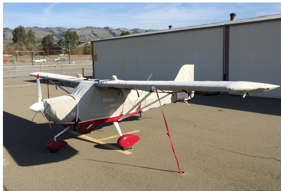
Eurofox Canopy, Engine, Wings and Empennage Covers

shorter useful life if used continuously outside than the all-year use material.