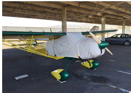
Kitfox Canopy & Engine Covers