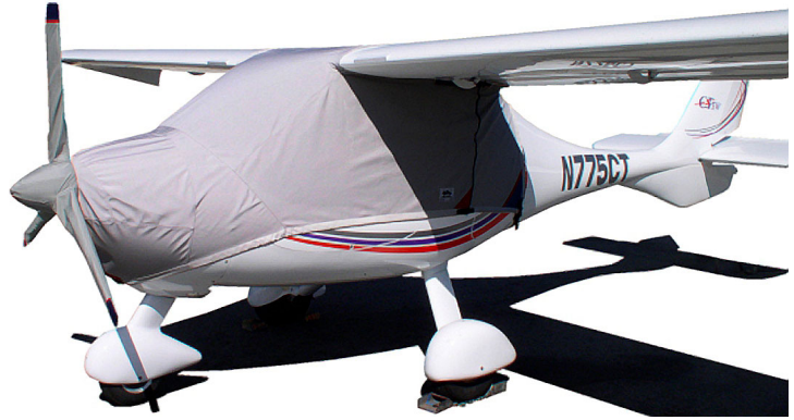
Flight Design CT Canopy/Engine Cover