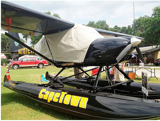
A-22 Over-the-Top Canopy Cover

occasional use outside. We also have an ultra lightweight material available for fitted hangar dust covers. For daily outdoor use, the non-travel Sunbrella Cover is the best choice.