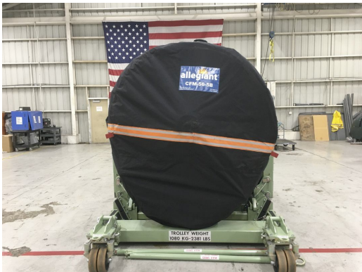
CFM56-5B Off Link Cover, fully enclosed

ALL-YEAR USE MATERIAL - Made with Solution dyed Polyester fabric, the all-year use material is the best option for sun protection and cover longevity. This heavier more durable material is intended for all weather conditions, such as rain and snow or lots of sun.