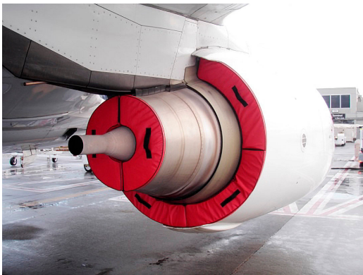
Boeing 737 NG Exhaust Plug Set, Folding Donut Ring Type

The Engine Inlet Plugs are custom fit for your Airbus A320 intakes, made with heavy-duty vinyl material, and stuffed with a single block of sculpted urethane foam. Each plug has a zipper that allows the foam to be removed and dried if necessary. Engine plugs have 'remove before flight' streamers sewn onto the face of the plugs. Most plugs are imprinted with the aircraft registration number in black for an extra charge. Storage bag NOT included. Engine plugs may be inserted after flight when the engine is still warm. Engine Inlet Plugs are commonly referred to as Cowl Plugs, Intake Plugs, Cowl Blocks, Engine Blocks, and Engine Bungs.