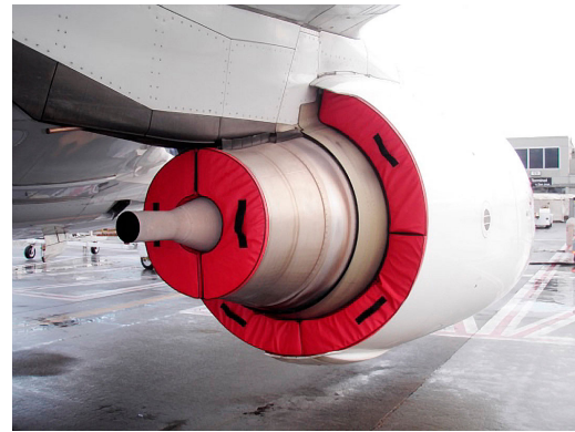
Boeing 737 NG Exhaust Plug Set, Folding Donut Ring Type