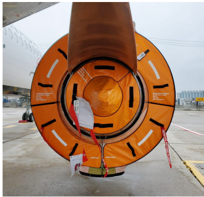
Airbus A320 Exhaust & Bypass Vent Plugs

The Engine Inlet Plugs are custom fit for your Airbus A321 intakes, made with heavy-duty vinyl material, and stuffed with a single block of sculpted urethane foam. Each plug has a zipper that allows the foam to be removed and dried if necessary. Engine plugs have 'remove before flight' streamers sewn onto the face of the plugs. Most plugs are imprinted with the aircraft registration number in black for an extra charge. Storage bag NOT included. Engine plugs may be inserted after flight when the engine is still warm. Engine Inlet Plugs are commonly referred to as Cowl Plugs, Intake Plugs, Cowl Blocks, Engine Blocks, and Engine Bungs.