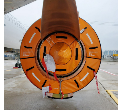
Airbus A320 Exhaust & Bypass Vent Plugs