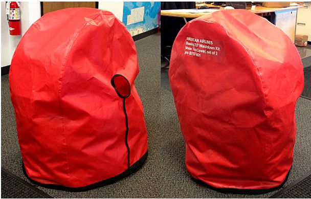
Boeing 757 Tire Covers, great for Wash Prep or Storage

ALL-YEAR USE MATERIAL - Made with Silver Acrylic Sunbrella canvas, the all-year use material is the best option for sun protection and cover longevity. This heavier more durable material is intended for all weather conditions, such as rain and snow or lots of sun.