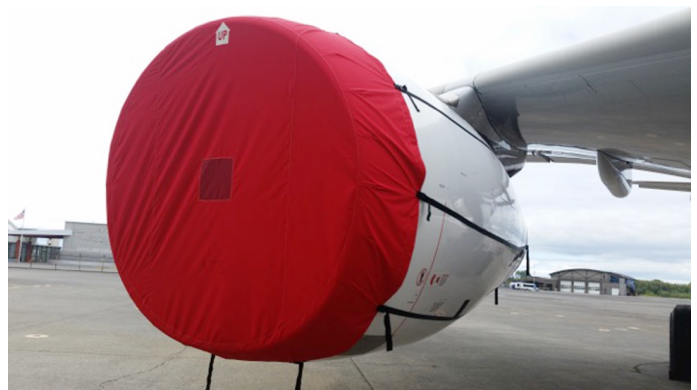
Airbus A330 Intake Cover, Trent 700 Engine