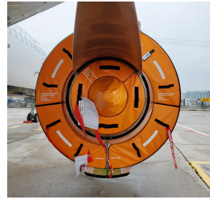
Airbus A320 Exhaust & Bypass Vent Plugs