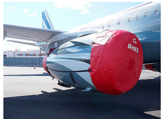
Airbus A319 Intake/Exhaust Covers set, IAE V2500