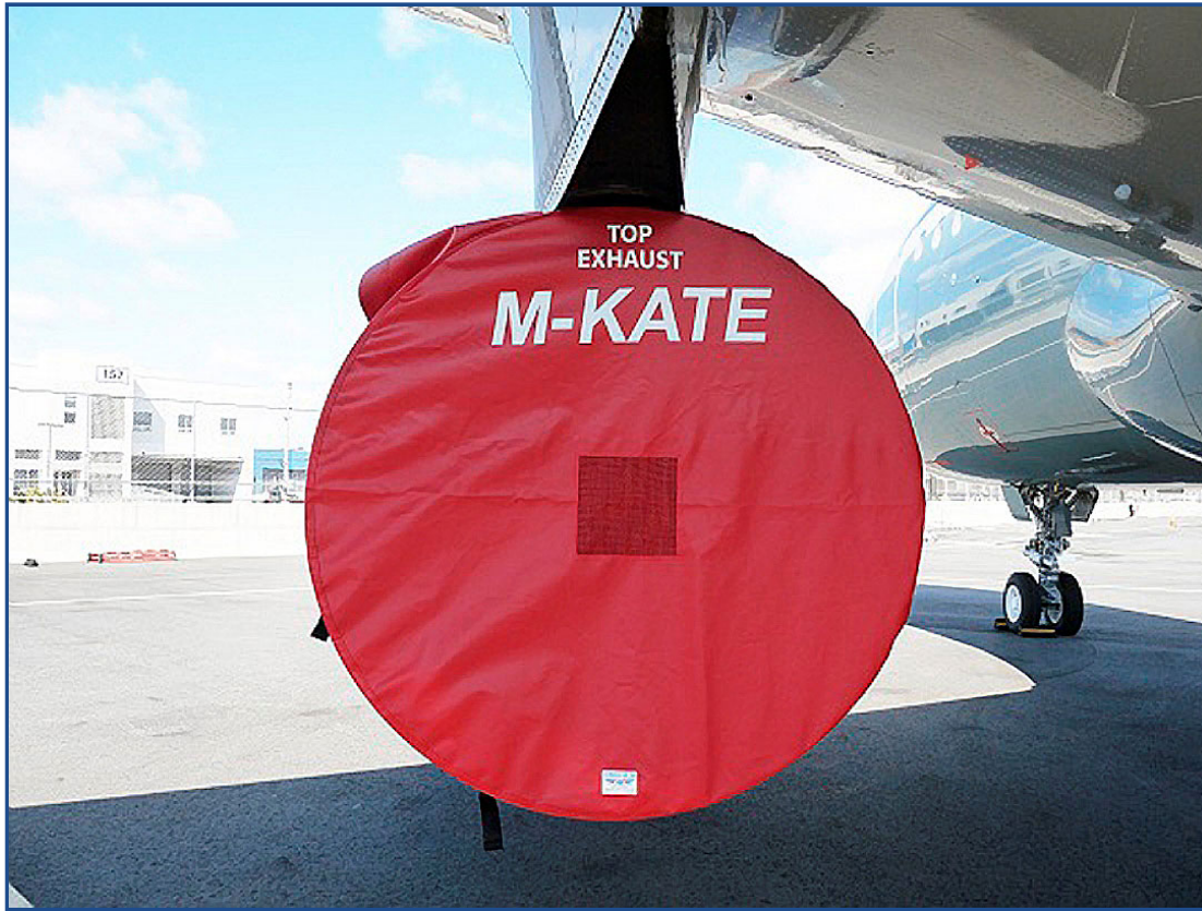
Airbus A319 Intake/Exhaust Covers set, IAE V2500