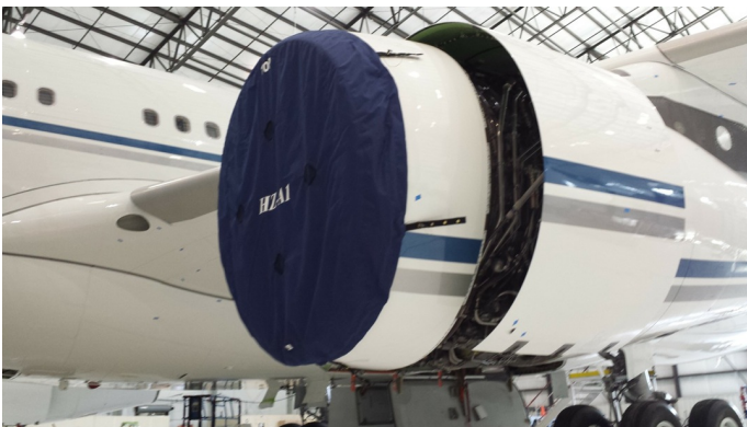
Airbus 340 Intake Covers