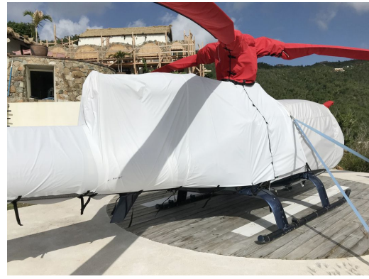
Aerospatiale Gazelle AS341 Bubble, Rotor Mast, Blade, Engine & Tailboom Covers (some are test fit covers)