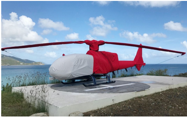
Aerospatiale AS341/342 Gazelle Full Cover Set