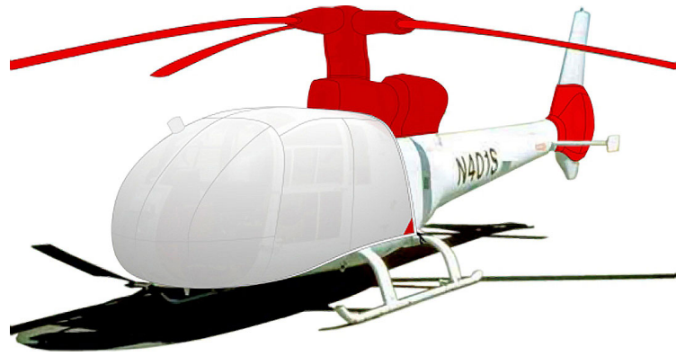
Gazelle Bubble, Engine, Rotor Hub, Blades & Tailfan Covers (Illustration)