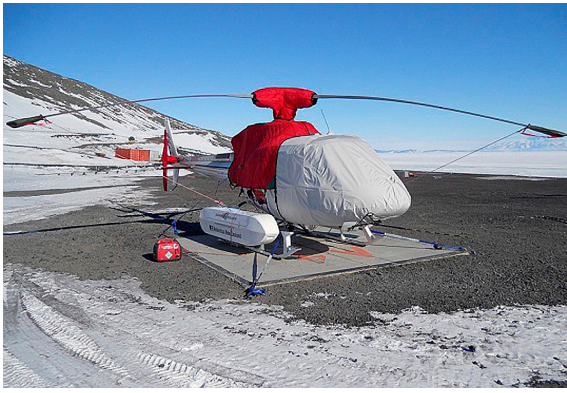
AS350 Bubble Cover w/ Cargo Mirror, Blade Tie-downs, Insulated Engine, Insulated Main Rotor Hub & Insulated Tail Rotor Covers