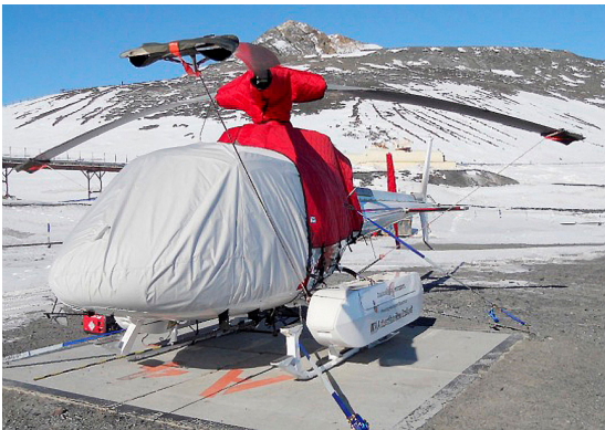
AS350 Bubble Cover w/ Cargo Mirror, Blade Tie-downs, Insulated Engine, Insulated Main Rotor Hub and Insulated Tail Rotor Covers