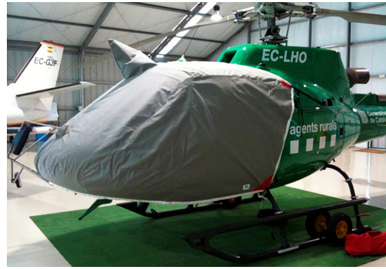
AS350 Bubble Cover with Wire Strike and Cargo Mirror