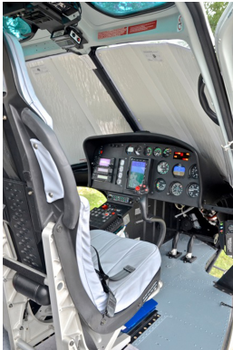
AS350 Windshield HeatShields

Heatshields are interior sunshades for an aircraft's windows or canopy glass. The product is a unique composite of closed-cell foam with a silver mylar finish. The semi-rigid design is stiff enough to stand along the inside of the windshield using sun visors or window framing. It folds up flat and easily stores in the included storage sleeve. Some designs may require velcro and suction cups. A Heatshield is an excellent short-term remedy for cockpit overheating.