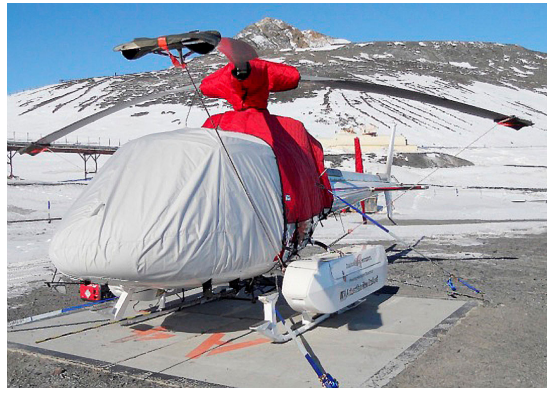
AS350 Bubble Cover w/ Cargo Mirror, Blade Tie-downs, Insulated Engine, Insulated Main Rotor Hub and Insulated Tail Rotor Covers