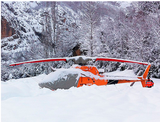
AS350 Bubble Cover, Insulated Main & Tail Rotor Covers, Blade Covers with tie-down detail

WINTER USE MATERIAL - Made with Solution-Dyed Polyester fabric, this option is intended for seasonal use to aid in deicing, rain mitigation, or for occasional travel. The material is lighter and more compact, but more susceptible to UV damage and may have a shorter useful life if used continuously outside than the all-year use material.