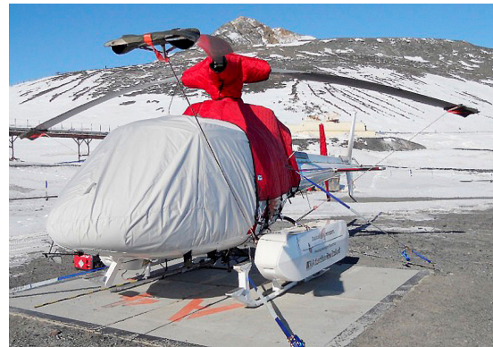
AS350 Bubble Cover w/ Cargo Mirror, Blade Tie-downs, Insulated Engine, Insulated Main Rotor Hub and Insulated Tail Rotor Covers