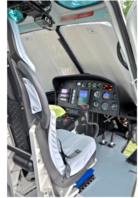
AS350 Windshield HeatShields