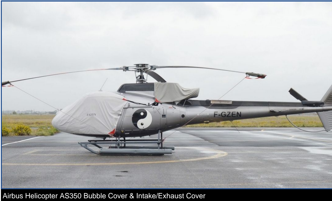
Airbus Helicopter AS350 Bubble Cover &amp; Intake/Exhaust Cover