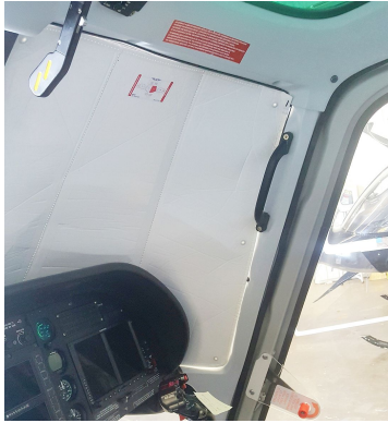
Aerospatiale AS350 Astar, Ecureuil, Esquilo, Fenec Windshield Heatshields

Heatshields are interior sunshades for an aircraft's windows or canopy glass. The product is a unique composite of closed-cell foam with a silver mylar finish. The semi-rigid design is stiff enough to stand along the inside of the windshield using sun visors or window framing. It folds up flat and easily stores in the included storage sleeve. Some designs may require velcro and suction cups. A Heatshield is an excellent short-term remedy for cockpit overheating.