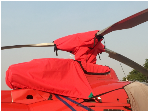
Airbus H-125 & Aerospatiale AS350 Intake/Exhaust Cover, Main Rotor Hub Cover with Weighted Skirt

WINTER USE MATERIAL - Made with Solution-Dyed Polyester fabric, this option is intended for seasonal use to aid in deicing, rain mitigation, or for occasional travel. The material is lighter and more compact, but more susceptible to UV damage and may have a shorter useful life if used continuously outside than the all-year use material.