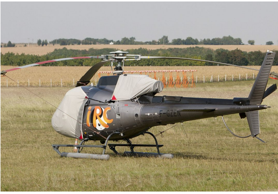
Airbus Helicopter AS350 Bubble Cover & Intake/Exhaust Cover