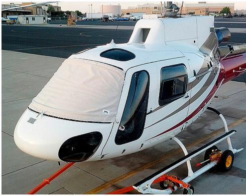
AS350 Windshield Cover, pinches in door jambs